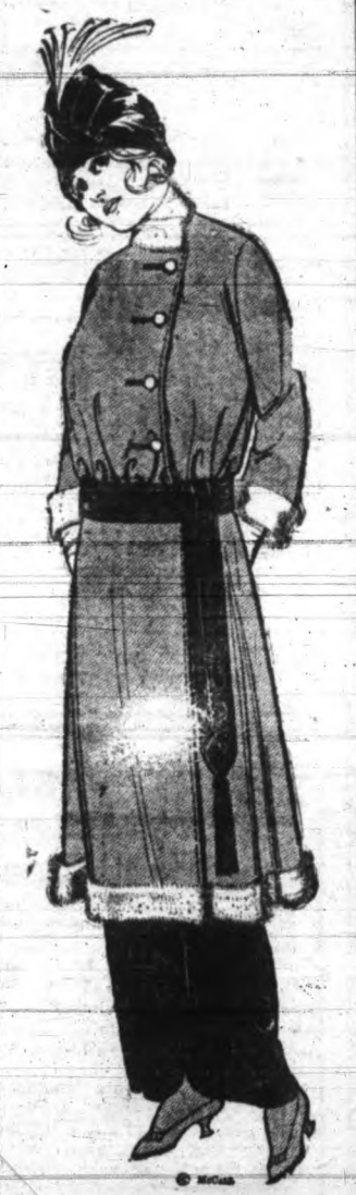
The Smart Minaret Coat a Popular New Winter Fashion.