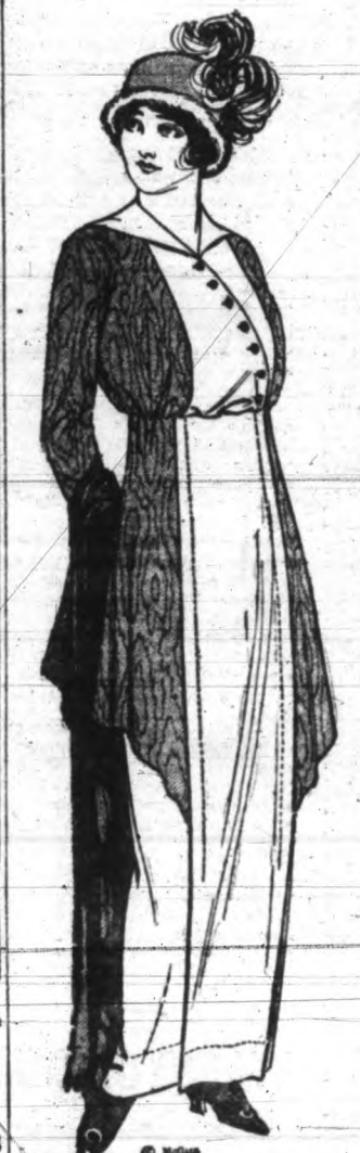
In Pale Green Velvet and Rich Blue Moire, a Bakst Scheme.

Jet is also reappearing, especially on hats, which, by the way, are extreme-