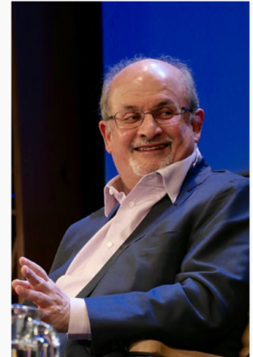
Rushdie at the 2016 Hay Festival

Born Ahmad Salman Rushdie 19 June 1947 (age 68) Mumbai, Bombay Presidency,