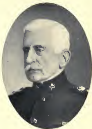
RIGHT HON. LORD CLAUD HAMILTON, M.P. (Commandant H.Q. C.D.)