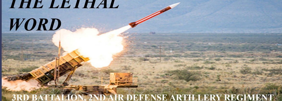
3RD BATTALION, 2ND AIR DEFENSE ARTILLERY REGIMENT