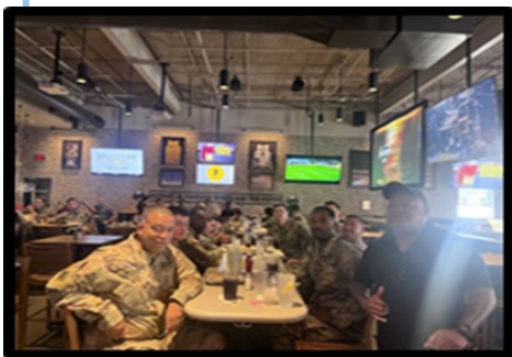
SFC Wilsons Farewell lunch at Buffalo Wild Wings.