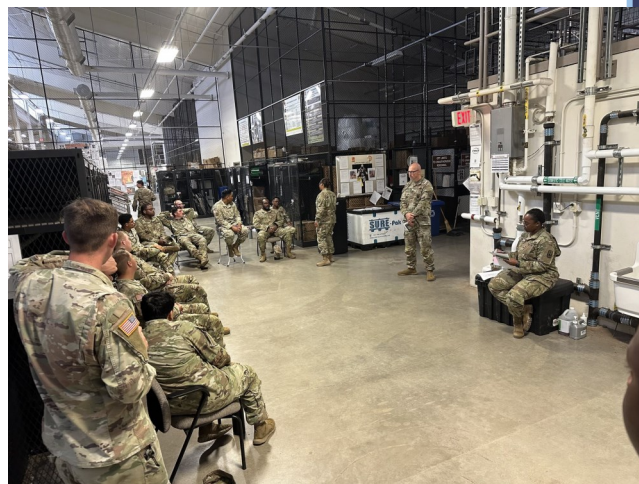
Alpha Battery NCOs conducting EO, SHARP and Resiliency Training