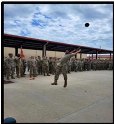
SPC Gaines throws for 14.1m during the ball throw for the king of skies challenge.