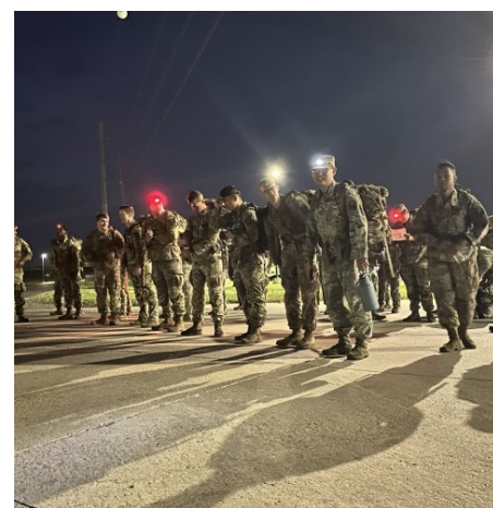
Brawlers are participating GAFPB.