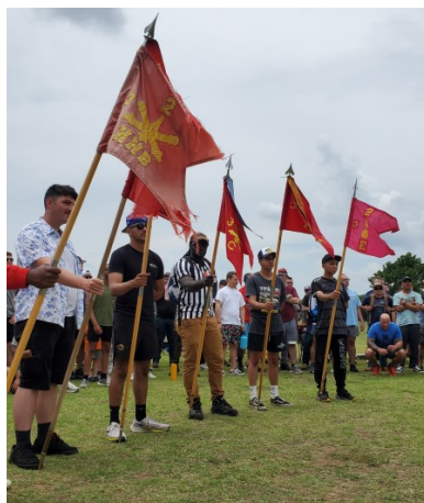
Brawlers during Lethal Sport