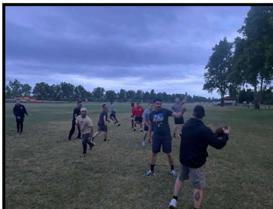
Wolf PAC Battery Fire Control Platoon TIMs

as well: their command/ leadership philosophy, interesting facts and a little bit about themselves. Launcher PLT also assisted BDE and represented Wolf PAC BTRY by staging two launchers at the BDE AoR ceremony.