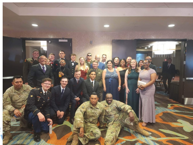
Alpha Battery participating BN Ball.