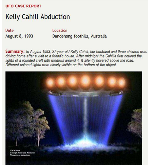
Fig. 9. 1993, UFO over Dandenong, Australia.

Obviously, if today we can't create and build performance particles accelerators, not even stationary, the ships of this kind were not terrestrial, the more that they could be seen from ancient times, that is when man still did not know how to fly.