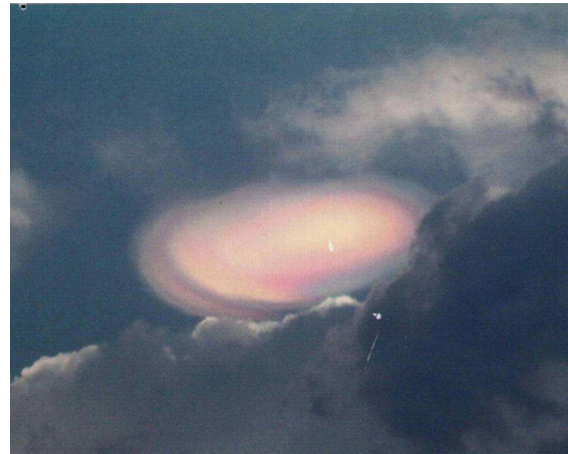
Fig. 1. Unusual atmospheric occurrence observed over Sri Lanka in 2004.

The gap left by the lack of institutional science research has given rise to researchers and independent groups, including the NICAP in the mid-twentieth century and more recently to the UFO Mutual UFO Network and the UFO Study Center (Center for UFO Studies). The term "UFOlogy" is used to describe the collective efforts of those studying the reports and evidence associated with unidentified flying objects.