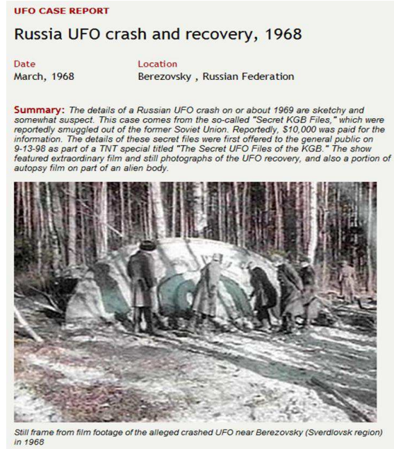
Fig. 5. 1968, Russia UFO crash in Berezovsky

Unfortunately, the physics we master today does not allow us to build such super-performance accelerators.