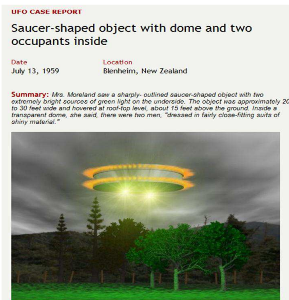
Fig. 4. 1959, Fly saucer reported in Blenheim, New Zealand.