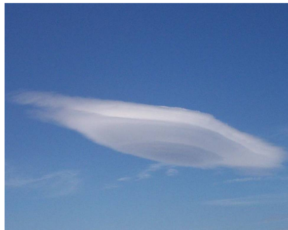
Fig. 2. Lenticular clouds have in some cases been reported as UFOs due to their peculiar shape.

UFOs have become a dominant theme in modern culture, making phenomena treated from a sociological and psychological point of view.