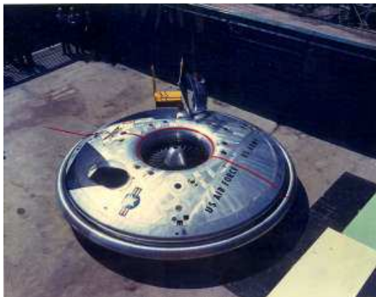
Fig. 12. The Avro Canada VZ-9 Avrocar was a VTOL aircraft developed by Avro Aircraft Ltd. (Canada). The Avrocar intended to exploit the Coanda effect to provide lift and thrust from a single "turborotor" blowing exhaust out the rim of the disk-shaped aircraft to provide anticipated VTOL-like performance.

Another important observation is that after the Second World War we started to build modern flying ships with many capabilities that can easily be confused with an alien ship (Fig. 12).