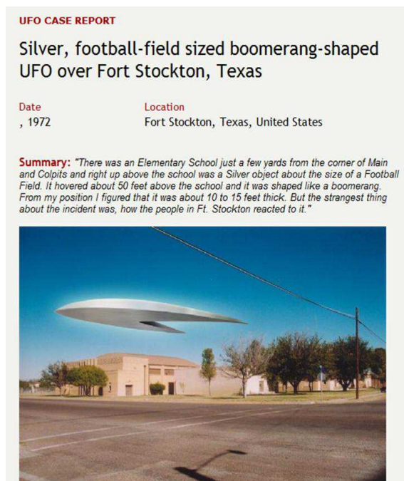
Fig. 6. 1972, UFO over Fort Stockton, Texas.

Until we master an advanced technique up to such a level, we can replace particle accelerators with very high-power lasers and repeated impulses at extremely low intervals.