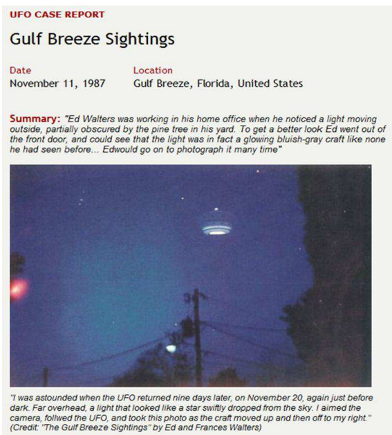
Fig. 8. 1987, UFO over Gulf Breeze, Florida, US

Obviously, if today we can't create and build performance particles accelerators, not even stationary, the ships of this kind were not terrestrial, the more that they could be seen from ancient times, that is when man still did not know how to fly.