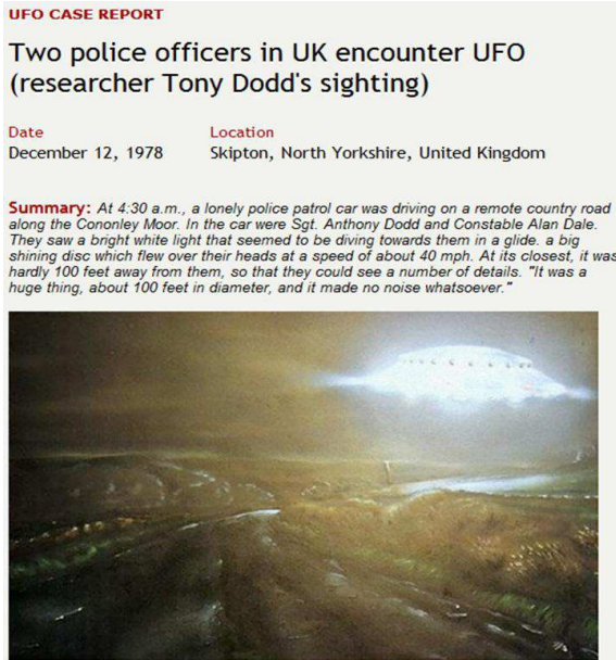
Fig. 7. 1978, UFO over Skipton, North Yorkshire, United Kingdom.