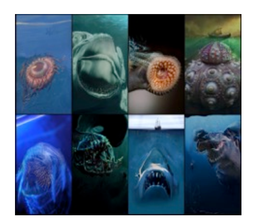
Image 8 Joey Holder Selachimorpha, 2017 © Joey Holder Courtesy of the artist

From the UFO Photo Archives of Wendelle Stevens Collection of Gordon MacDonald