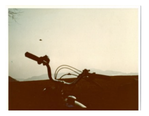
Image 2