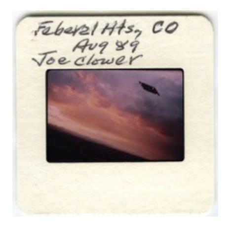
Image 4