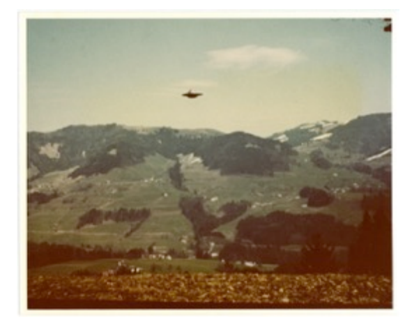
Image 3