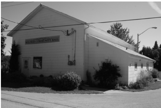
The fate of the Wilfrid Hall will be discussed at a special Brock council meeting at the hall on Monday, July 19.

As the owners of the hall but not the land, Brock Township has been responsible for maintaining the building ever since it