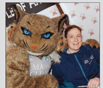
Thanks to Lindsay Whalen, Prowl, and all of the other mascots and friends who joined us for this fun day!