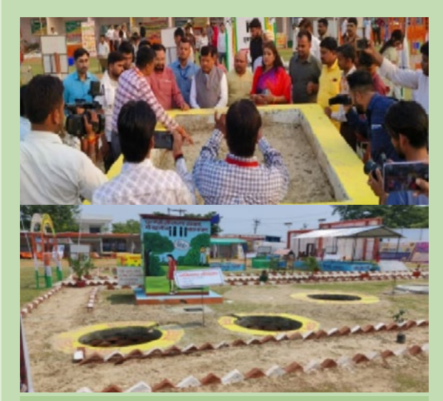
To read more, Click here

In a remarkable initiative, the Swachh Bharat Mission Grameen (SBM-G) team of Shravasti district, in collaboration with UNICEF in Uttar Pradesh, developed live models of ODF Plus assets that effectively manage solid and liquid waste. Such assets are vital to transforming Gram Panchayats (GPs) into ideal ODF Plus villages that are visually clean.