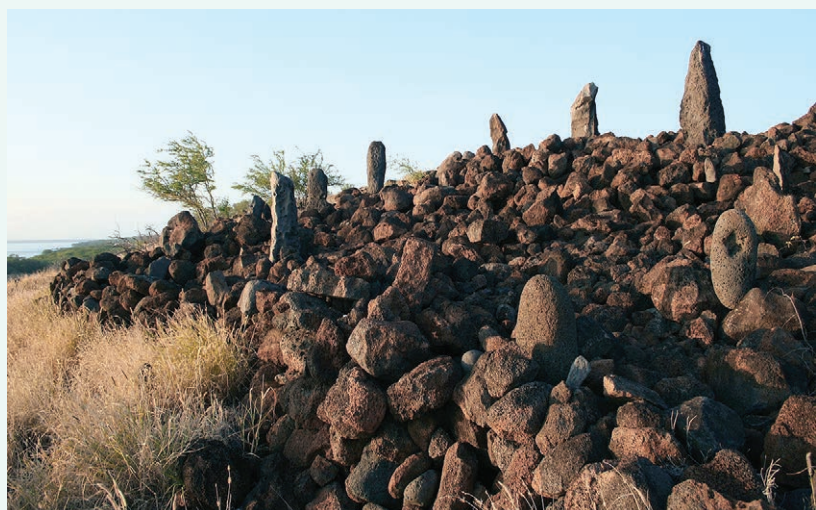
Ko'a Holomoana heiau at Māhukona, Hawai'i Island