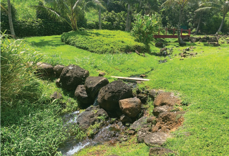
'Auwai at Waiaikalua, Kaua'i