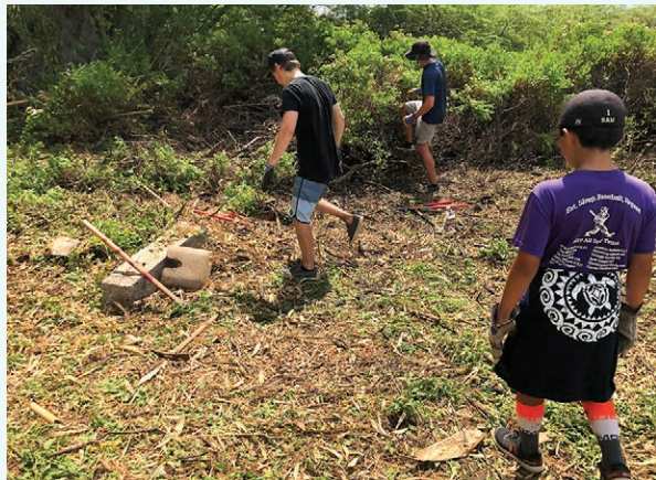
Youth volunteers clear and restore Lā'ie wetlands in Kihei, Maui