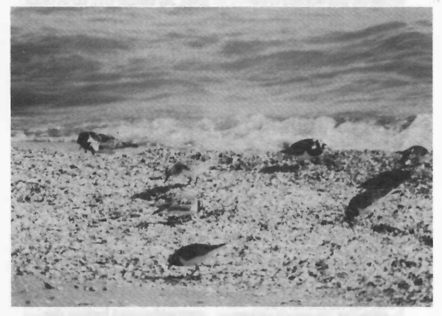
Ruddy Turnstones and Sanderling. Crane Creek SP (Lucas Co.), 5/20/95.

I arrived back at Kildeer with my wife at about 8:45 a.m. The stilt was still where I left it, and we watched it for some time. Then I scanned the mudflat for other birds, and found a few Black-bellied Plovers. But when I looked back for the stilt, it was gone. Knowing that the willows lining the pond prevented the entire area from being viewed from one location, I drove to the next small parking lot to the west. There I found the stilt again, this time at a distance of only 200 feet. We watched the bird until about 9:40 a.m., when it took flight and headed east and then south. It was apparently never seen again. By John Herman, 1217 Teddy Avenue, Bucyrus, OH 44820