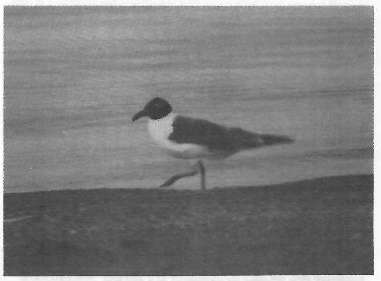
Laughing Gull. Alum Creek SP (Delaware Co.), 5/30/95.

For a total of 151 hours (1951 net hours) on 31 days between March 14 and June 6, 1995, I banded birds at Lakeshore Metropark (Lake Co.). My final tally was 3102 individuals banded, representing 103 species. Peak movements per month came on March 31 (101 indiv. banded), April 11 (177 indiv. banded), and May 10 (221 indiv. banded). My top numbers banded were: White-throated Sparrow- 393; House Finch--359; Song Sparrow-- 324; Am. Goldfinch-- 288; Dark-eyed Junco-- 285; White-crowned Sparrow-- 118; Blue Jay-- 107; Gray Catbird-- 105; Chipping Sparrow-- 59; & Swamp Sparrow-- 57. Data by John Pogacnik, 4765 Lockwood Road, Perry, OH 44081.