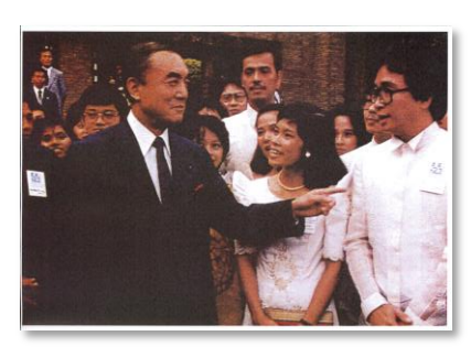
The first batch trainees visited Mr. NAKASONE (the then prime minister) (May, 1984)