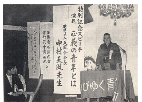
"the Growing Youth meeting" in 1966