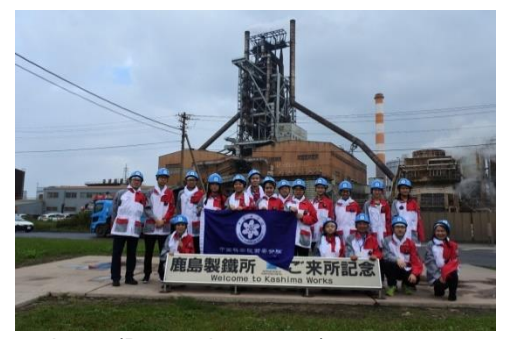
Left; Viet Nam; Training for University students (December, 2016) Right; China; Training for High school students (October, 2017)