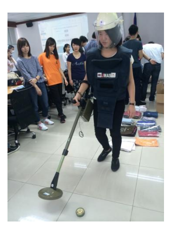
(2015.3) Training program in Cambodia (Experiene of Mine-Cleaning)

2014 Contracted "University students Field Study Program" (JICA)