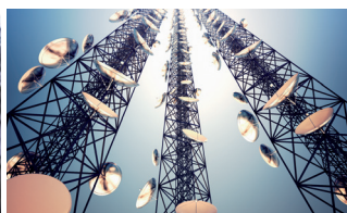
Outdoor Broadband Wireless Access