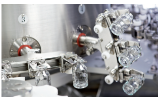
Industrial Automation / Factory Automation