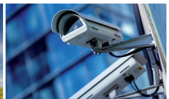
IP CCTV & Security