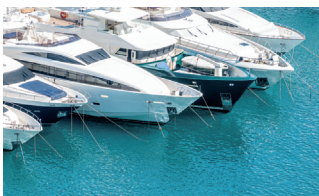
Marine Electronics / Cruise / Shipyards