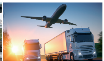
Aerospace / Automotive / Commercial Vehicles