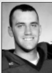
Matt Schaub senior QB