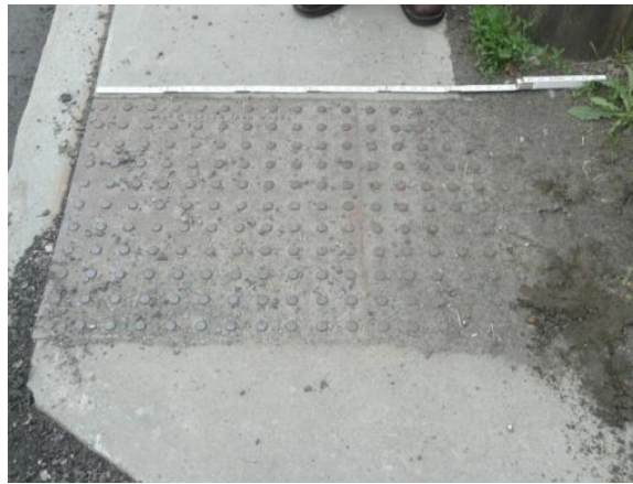
Figure 3: East Jordan Works – Detectable Warning Plate in 2009