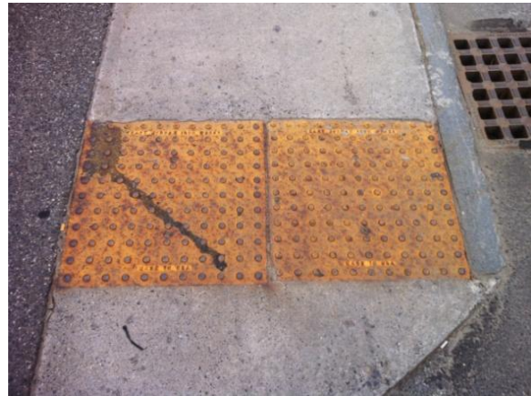
Figure 4-5: East Jordan Works – Detectable Warning Plates 2013

Neenah Foundry Co.: Unpainted Cast Iron Panels