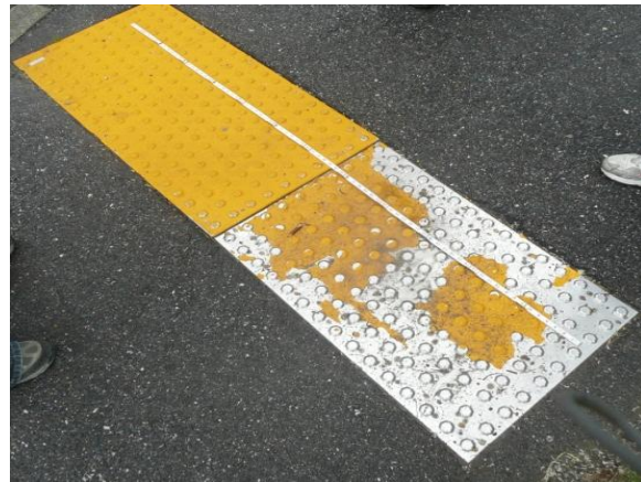
Figures 8-9: MetaDome, LLC. – Asphalt. 2009