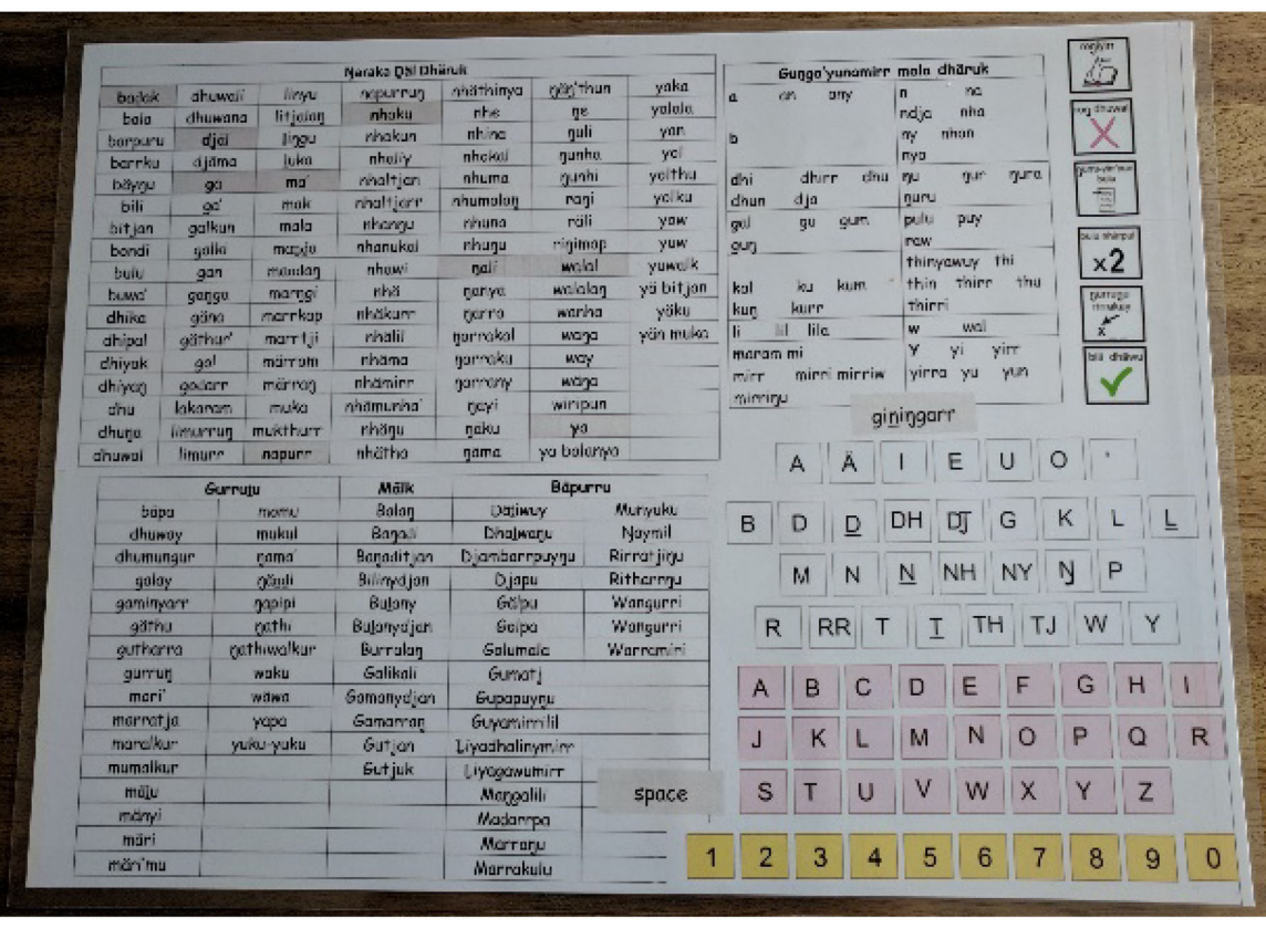
Figure 2. Yolnu AAC system prototype B. Yolnu core word board with core vocabulary represented in words presented in alphabetical order, top left. Suffixes presented top right, with far right side panel with cells for message editing. Yolnu core categories "kin relations," "skin names," "clan names" presented bottom left, and Yolnu and English alphabets with numbers presented in bottom right.