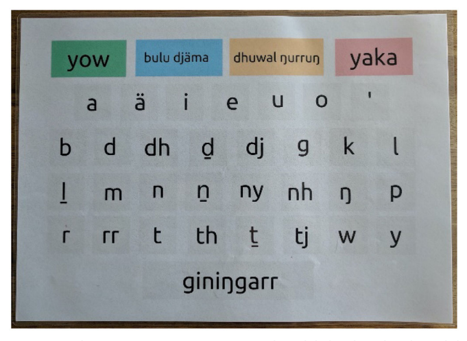
Figure 1. Yolnu AAC system prototype A. Yolnu alphabet board with English alphabet on reverse side, same format. Top row presents cells for message editing. Second row presents Yolnu vowels in "short and long pairs." Rows 3 to 5 present consonants in alphabetical order. Final row cell "button" to indicate space bar.

Thirteen key themes were identified to guide Yolnu AAC system design from a Yolnu perspective: four related to vocabulary (Supplemental Table 2); five related to layout