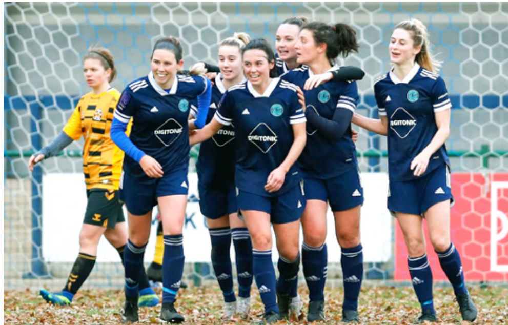
The team beat Cambridge United in November

London Seaward, formerly Leyton Orient WFC, on their progress in the women's league