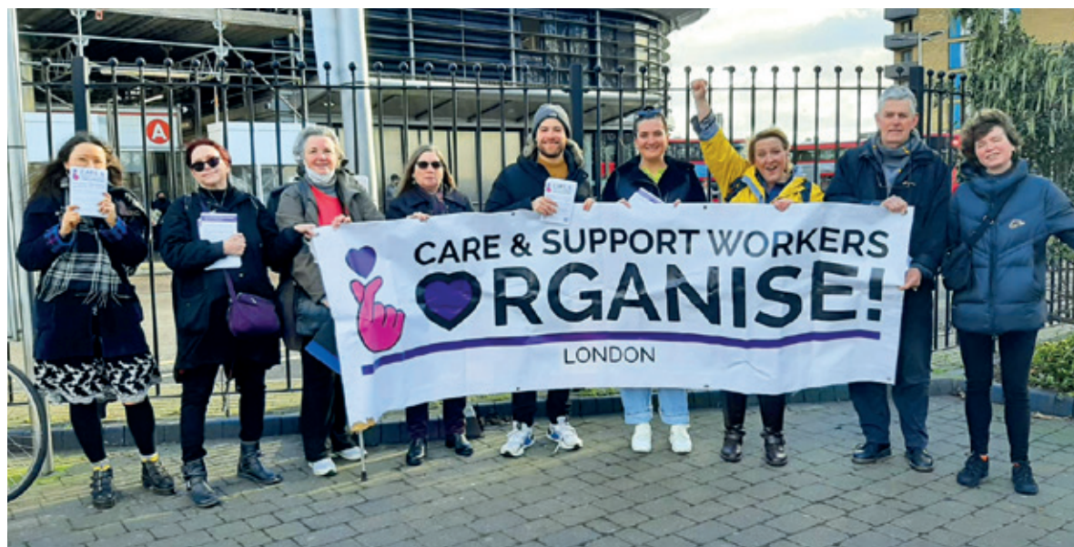
Carers leafleting and speaking to residents in Walthamstow

By contrast, she said the essential user permit offered by Waltham