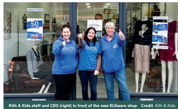
Kith & Kids staff and CEO (right) in front of the new ELSSware shop