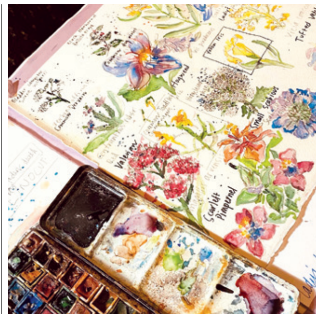
Examples of her work