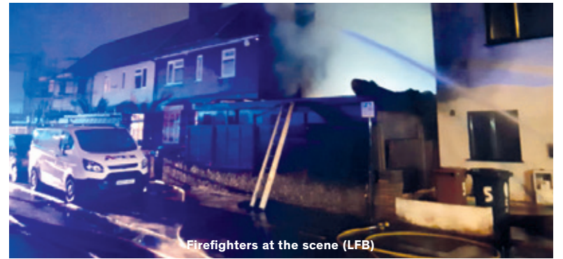
Firefighters at the scene

W althamstow residents were evacuated after sheds with gas cylinders inside caught fire.