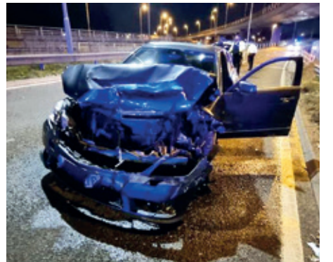
The driver’s car after the crash

The driver is accused of having been almost three times over the legal limit.