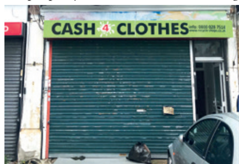
The badly and secretly converted shop in Vicarage Road

The council also found evidence of rats, a leaking waste pipe, a defective smoke alarm, a faulty boiler, inadequate locks and no fire doors. The council took over the property a month later, forbidding