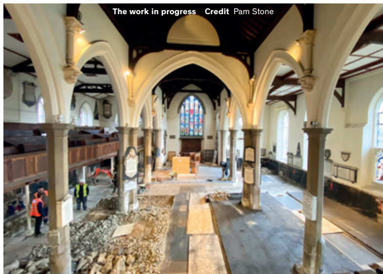
The work in progress

An ancient Walthamstow church is undergoing a multi-million pound renovation to allow it to host concerts as well as worship. The project began in 2015, when it was discovered that St Mary's in Church End was in