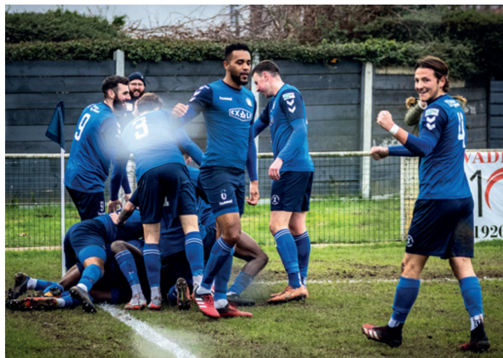
The team celebrate during a January match against Enfield