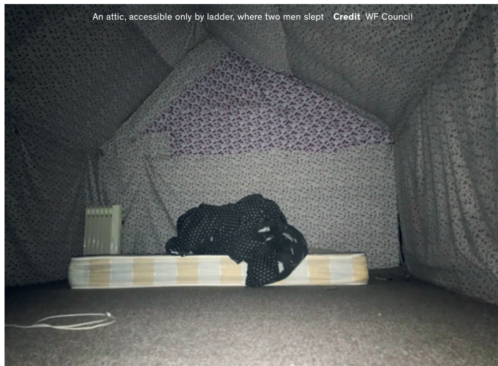
An attic, accessible only by ladder, where two men slept