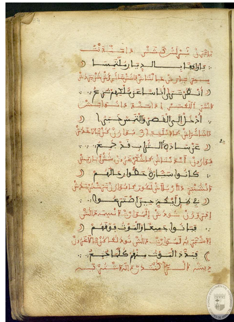
Figure 3.2 A Page from the 1481 Codex of "The City of Brass."

The first figure shows a folio of a different chapter without the Aljamiado translation, which the alfaquí presumably did not have time to or chose not to complete. The alfaquí used two different colors of ink: black for Arabic consonants and red for Arabic vowels, the Aljamiado text, occasional corrections, insertions, and marginalia. The folios show a perfect correspondence between the Arabic lines and the Aljamiado lines (one exception being f. 80r, where the alfaquí skipped an Arabic line and had to remedy it), indicating a possible desire to use it as a tool for teaching Arabic to his increasingly Romancized community. There is also an evident desire to provide a complete translation of the Arabic original. Despite the presence of a considerable number of literal translations and Arabisms, the alfaquí translates every single word, and the result is a complete Romance translation of "The City of Brass," unlike subsequent versions of this story a century later in which many Arabic phrases and words were inserted. The thoughtful process underlying this effort to create an integral