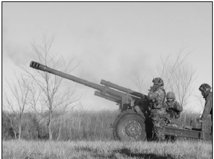
MBdr Christian Jax of 10 Bty, prepares his howitzer for a Number Ones Open Action.

2004 flew by for 56 Field. More than 2,600 81mm rounds fired, without error, 80 105mm rounds fired, showing we can still hold our own with a howitzer. 5 Mortar crse serials with 100% success rate, 83 mor grads, 600+ trg days attended by Regimental personal for Mortar training over and above the planned Regimental training calendar published in the Fall 2003. Despite this intense training tempo during the year, we still filled the third highest number of summer tasks among the 16 Bde Units. We participated in more than twenty-five Remembrance Day events throughout our Area and numerous fairs, trade shows and displays over the year. Most importantly, by quickly and seamlessly adapting to mortars, we showed adaptability and flexibility of the Artillery Branch. Adopting our new role under LFRR was challenging, but certainly not limiting our insurmountable, after all, we are Gunners!