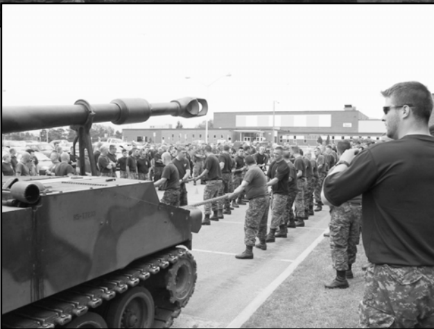
(above) M109 pull during CO's Challenge 2004.