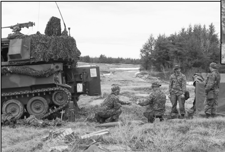
Final M109 Deployment.