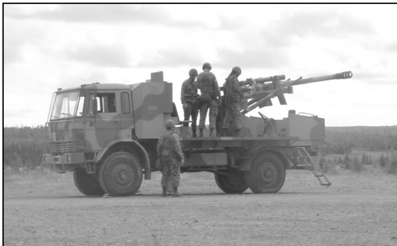
The MOBAT in action ready to fire a round into the Hersey Impact Area.