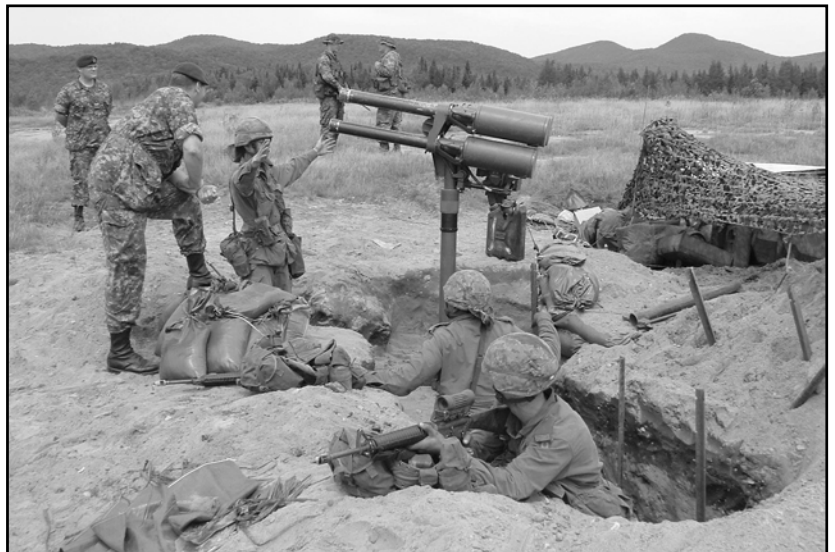
Le cours Javelin 2003/Javelin Course 2003

The year 2003 has been an enormous challenge for all personnel within the unit. The unit will work hand in hand and put all the effort necessary to make the best of the next year and successfully meet all the upcoming challenges. 58th Air Defence Battery : One Battery, One team!