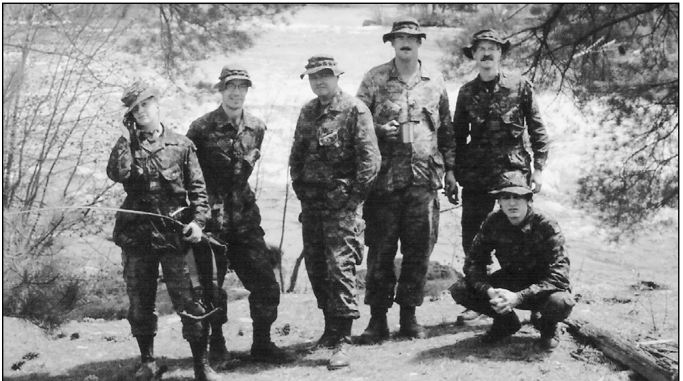
Band of Brothers - Ex STALWART THRUST.

The unit is in a rebuilding cycle, is actively recruiting and looks forward to an dynamic 2004/05 training year