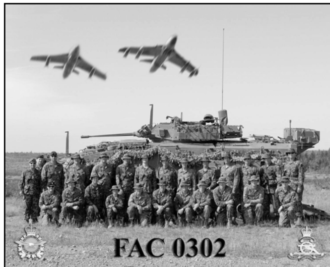
Two Hawker Hunter aircraft over fly the Forward Air Controller Course.

2003 was an interesting, challenging, and exciting year for all Canadian Gunners, and especially for those at the School. The Army's focus on its Intelligence, Surveillance, Target Acquisition, and Reconnaissance (ISTAR) capabilities promises a bright future for the Royal Regiment of Canadian Artillery and for the Royal Canadian Artillery School.