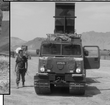
Radar Troop's Arthur Radar System.