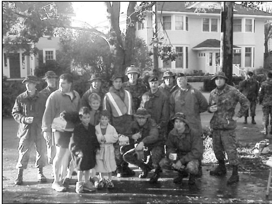
7 Platoon receives Tim Hortons from their friendly neighbourhood during Op SPLINTER.

A last minute decision was made to add the Air Defence Artillery to Ex RESOLUTE WARRIOR, the first Brigade Training Event since 1992. With only one month to prepare and execute the deployment to Wainwright, Alberta, the Regiment hit the ground running after the March break to get the equipment and personnel pre-