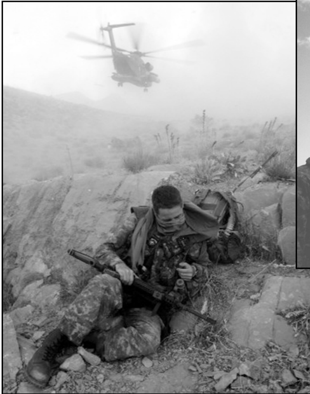
G31 conducting resupply during OP ATHENA.

The strength of any unit has always been its soldiers and the 2nd Regiment is certainly no exception to this maxim. The Regiment is blessed with a large number of exceptional soldiers with every kind of personality and background. It is this diversity which is at the root of the Regiment's success. Rather than have you read about it, we would rather you saw our 2004 story in pictures.