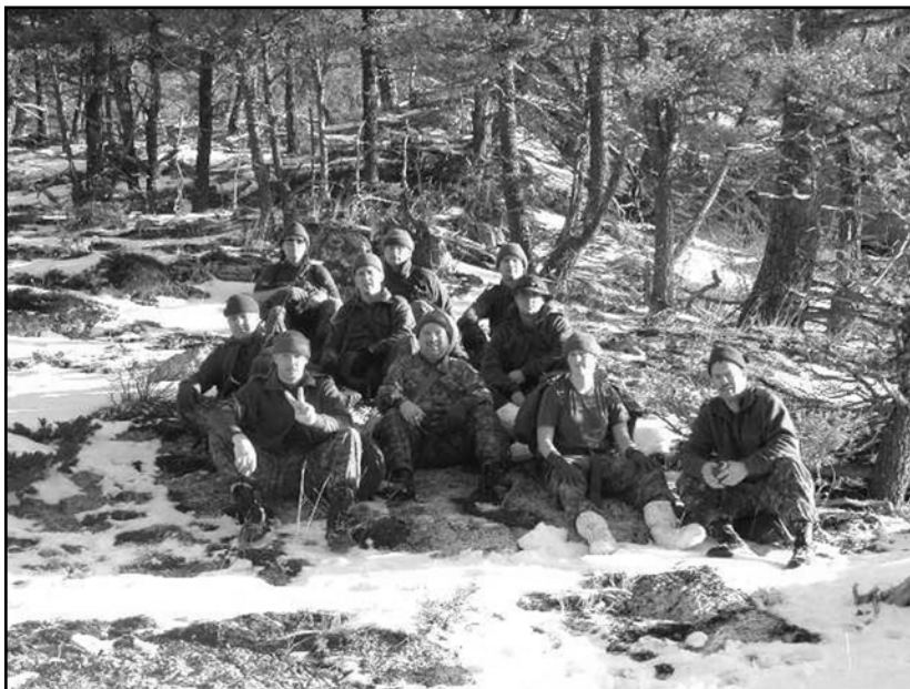
TREKKING ARCHER 2003.