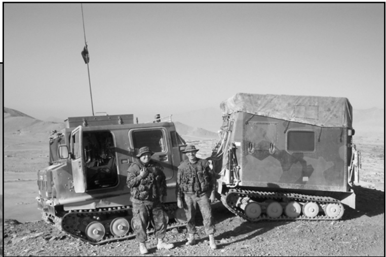
(above) Radar deployment on OP ATHENA.