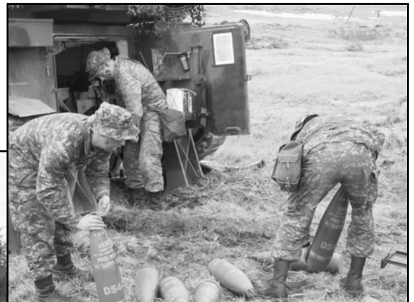
Gun Det preparing ammunition for final M109 Shoot.