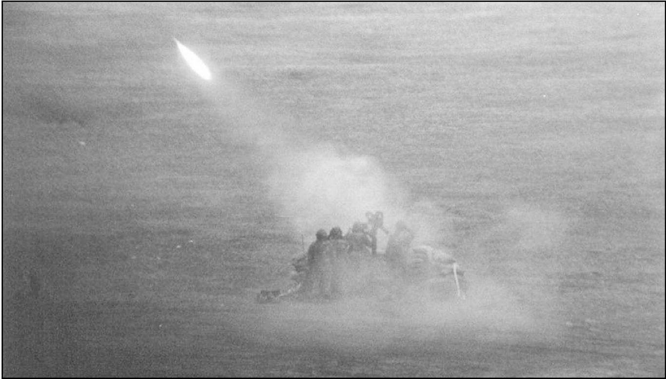
Javelin Engagement - Through x8 Binocs - Suffield.