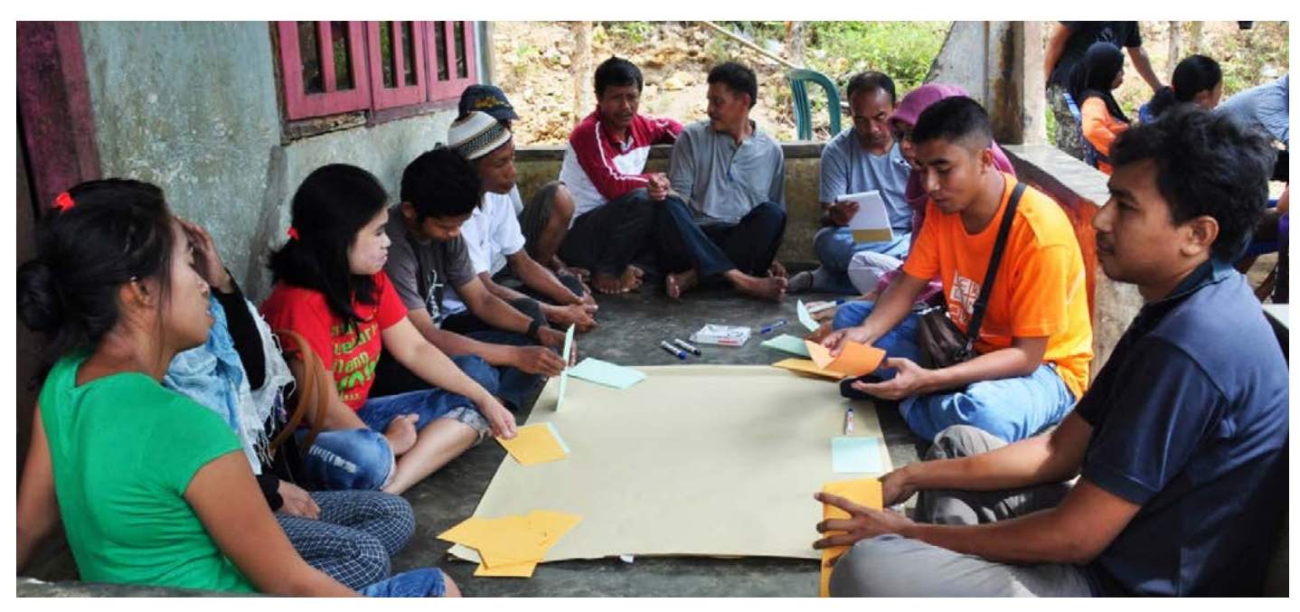
Discussion with community members in Alaloma Sub-district.

Clashes in Indonesia over management of natural resources, particularly forests, is a frequent occurrence. Newspaper and television reports about land-use disputes between groups are common and Southeast Sulawesi Province is no exception.