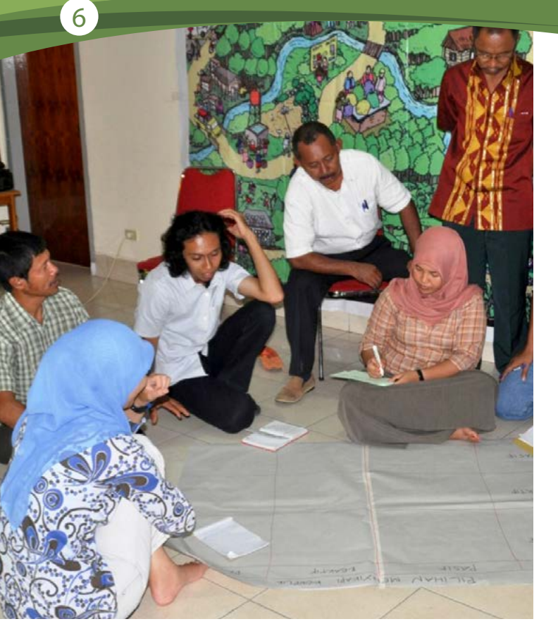
Group discussing attitudes towards handling conflict.

conflict experience and present the results to the other groups. Through this participatory approach, everyone was able to contribute and share their knowledge.