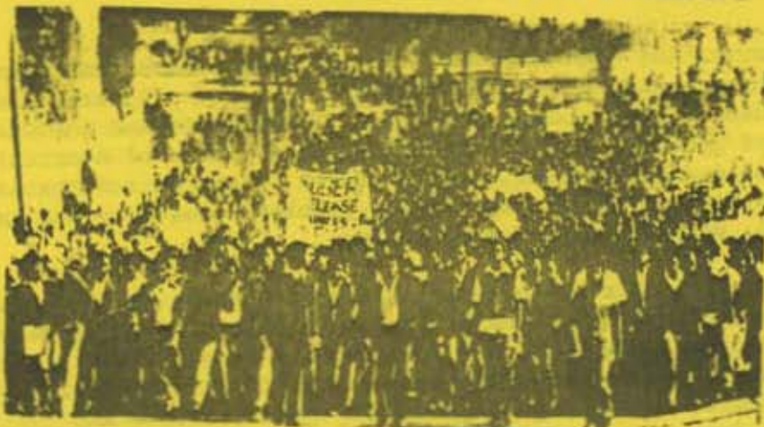
SOWETO REBELLION, AUGUST-1976

The New African Liberation Support Committee initiated and build this broad-based coalition of progressive organizations and individuals in Chicago and throughout the Midwest to fight against the sale of the Krugerrand gold coin from South Africa, and to fight for the victory of the peoples of Southern Africa. We have won a victory in this short but intense 3 months of struggle.