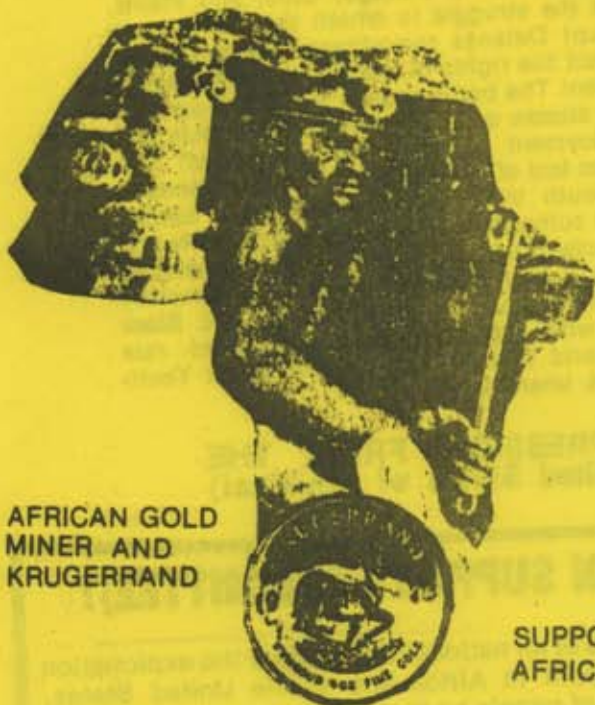
AFRICAN GOLD MINER AND KRUGERRAND

VICTORY TO THE PEOPLES OF SOUTHERN AFRICA!