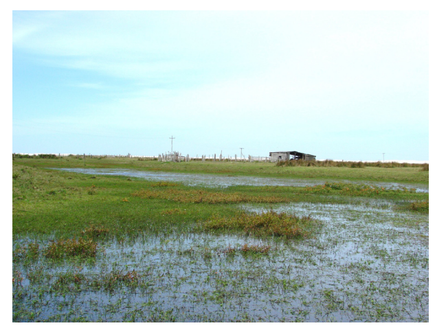
Image 2. Occurence site of Austrolebias wolterstorffi in Lagoa do Peixe National Park.

The Lagoa do Peixe National Park (LPNP) is the only conservation unit in southern Brazil protected under the Ramsar Convention. The LPNP presents a variety of continental, estuarine and marine wetlands, ensuring the survival of a wide variety of species of several groups