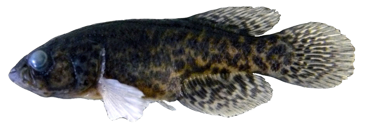
Image 1. Austrolebias wolterstorffi (46.35 SL; MCP 44520) collected from Lagoa do Peixe National Park (LPNP).

was for the São Caetano locality, more than 100km of protected area (see the map in Costa 2006). This paper documents the discovery of the species in Lagoa do Peixe National Park and presents recommendations for its conservation in southern Brazil.