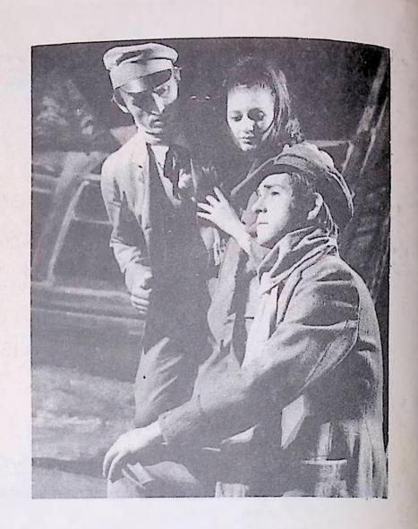
The Jewish Theater in Poland