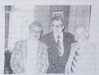
L to r: Tawfiq Zayyad, mayor of Nazareth and Communist member of Knesset; Sergio Vuskovic Rojo, mayor of Valparaiso, Chile, during Allende's Presidency; Jack Kling

I would like also to relate that the Congress reflected many inspiring experiences, including the fact that despite all difficulties, the Communist Party of Israel has grown by 40 percent between the 17th and the 18th Congresses. The growing influence of the Party, especially among the Arab people, but among the Jewish people as well, and especially among younger people, was also reflected in the many greetings received by the Congress, in person and by message, from non-Party personalities. One of the