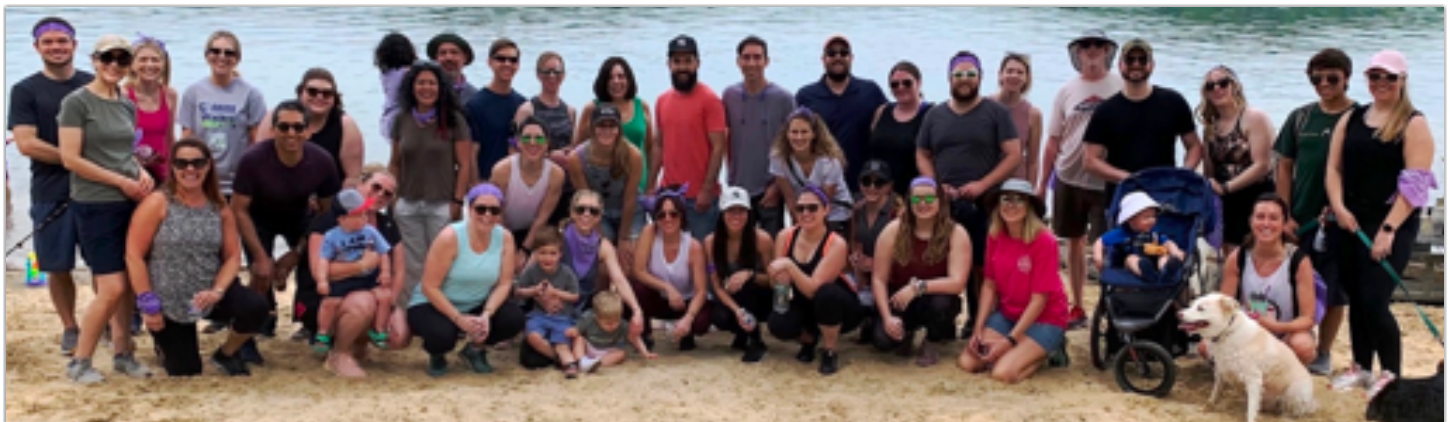
The McCann Health New Jersey (MHNJ) team.