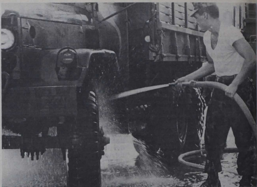
AGRICULTURAL WASHDOWN — Marines of BSSG-4 will spend about 36 hours cleaning vehicles and heavy equipment following "Teamwork-80," in North Norway this month. The "desnailing" operation is required before the vehicles can re-enter the U.S.

No facilities presently exist in Norway to perform the washdown. Therefore, the expeditionary expertise of BSSG-4 will be employed to set up the