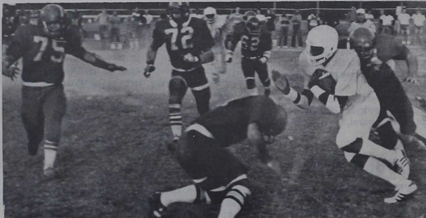
NO WHERE TO GO —The 8th Engineer Battalion found that they had no avenues of escape as they suffered their second loss of the season at the hands of the 8th Motor Transport Battalion 28-20.

The 8th Engineer Support Battalion slipped into 5th after suffering their second straight loss