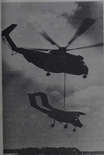
RARE AIR PAIR — A Marine CH-53 "Sea Stallion" helicopter lifts and carries a Marine OV-10 "Bronco" observation plane at Marine Corps Air Station, New River.