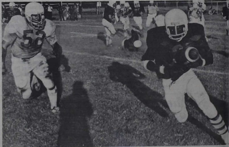
AROUND END —A 8th Communication Battalion runner races to the outside in a game against Landing Support Battalion. The Comm. team hoisted their season record to 1-1 by defeating Landing Support 28-14 in action Sept. 9.