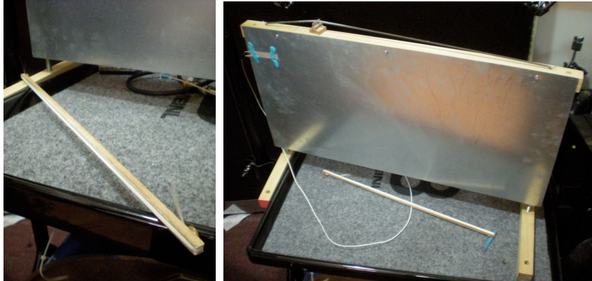
Fig. 1 Bowstick and Spring Instrument.