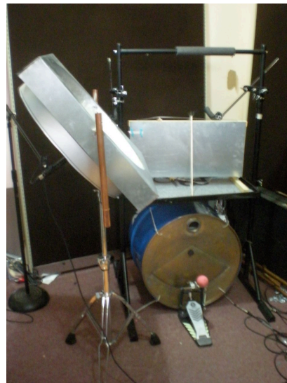
Fig. 3 Bowed Spring Pan Kit