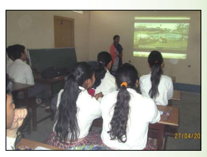
AUDIO VISUAL CLASS