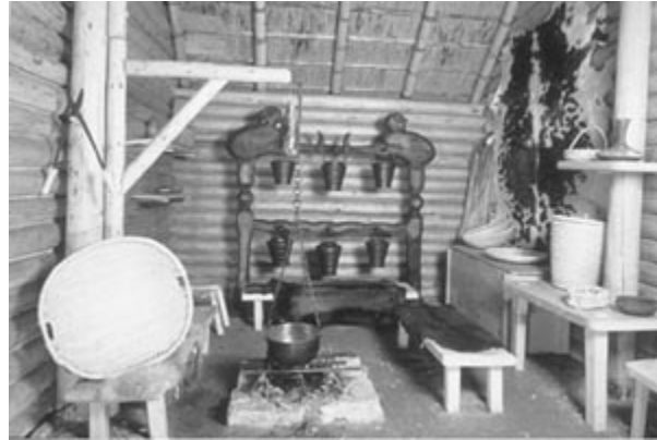
Reconstructed interior of an early Celtic home. ( Kelten Museum, Hallein, Austria )