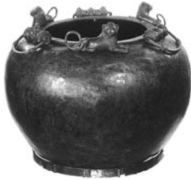
Hochdorf tomb caldron with lions on rim. ( Württembergisches Landesmuseum Stuttgart )