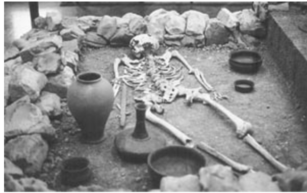
Reconstructed Celtic warrior's grave from Austria.