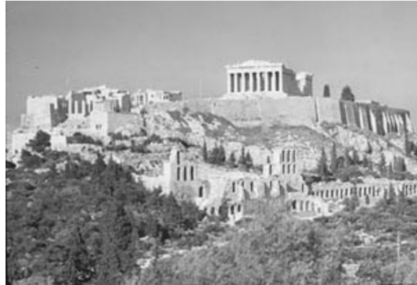
Parthenon temple on the Acropolis of Athens, the city where Posidonius studied philosophy. ( Philip Freeman )