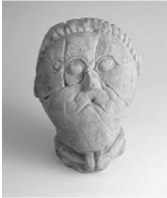
Stone head with torque from Msecké Zehrovice sanctuary, Czech Republic.