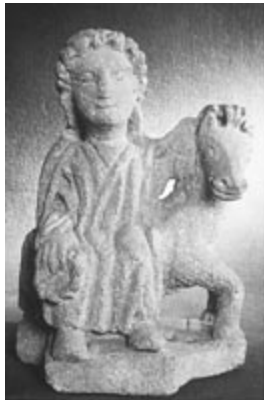
Statue of the Celtic horse goddess Epona. ( André Rabeisen, Alesia Museum )