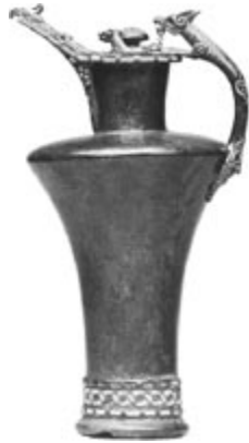
Basse-Yutz flagon from France, c. 400 B.C. (© The Trustees of the British Museum )