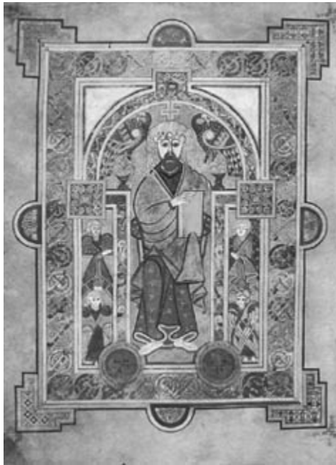
Book of Kells, Trinity College, Dublin. The elaborately decorated Book of Kells continued the traditions of early Celtic La Tène art into Christian times.