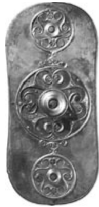
Battersea Shield from London, England.