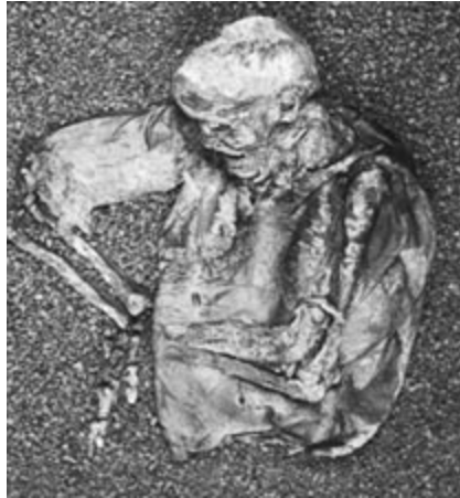
Body of Lindow Man from Cheshire, England, first century A.D.