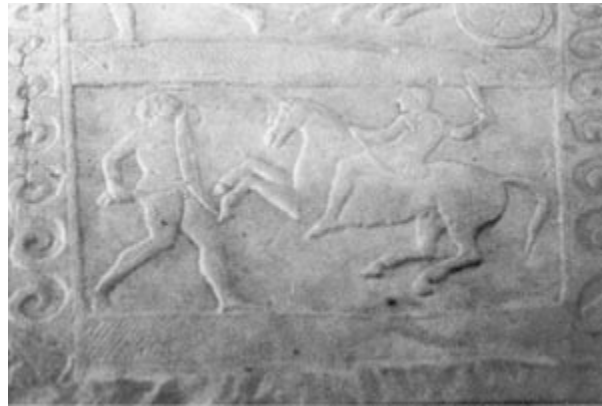
Etruscan horseman fighting a naked Celtic warrior, fifth-century B.C. monument from Bologna, Italy.