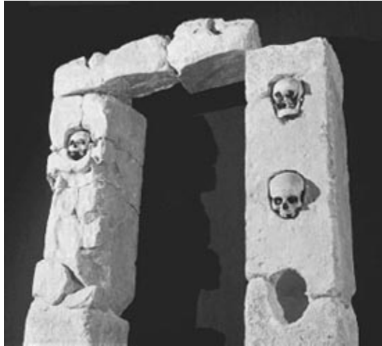
Pillars with notches for severed heads from a Gaulish sanctuary at Roquepertuse in southern France.