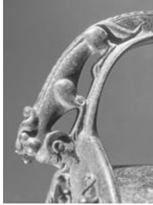
Handle of an early Celtic flagon, c. 400 B.C. ( Kelten Museum, Hallein, Austria )