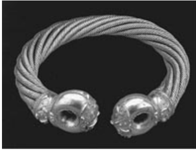
The Great Torque from Snettisham, England, early first century B.C.