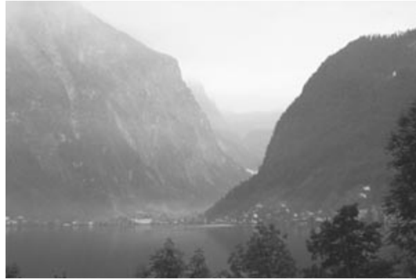
Valley of Hallstatt in western Austria, site of early archaeological evidence of the Celts.