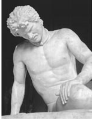
Dying Gaul. (Capitoline Museum, Rome)