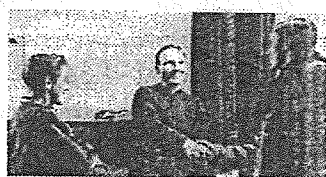
BOYSVILLE OF MICHIGAN OCT 1952 Remembering the Past . . .