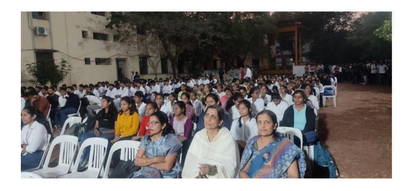
All Department General Secretaries were felicitated by Honourable guests and class topper were felicitated by AAGECA.