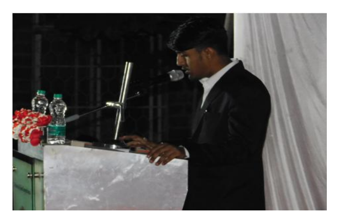
Oath by Students Council Member