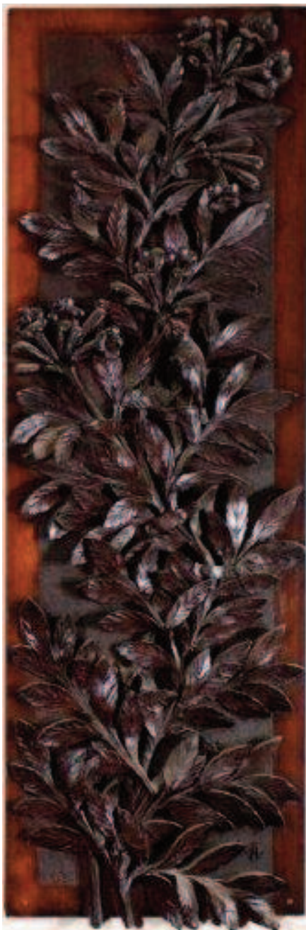
The Trumpet Vine