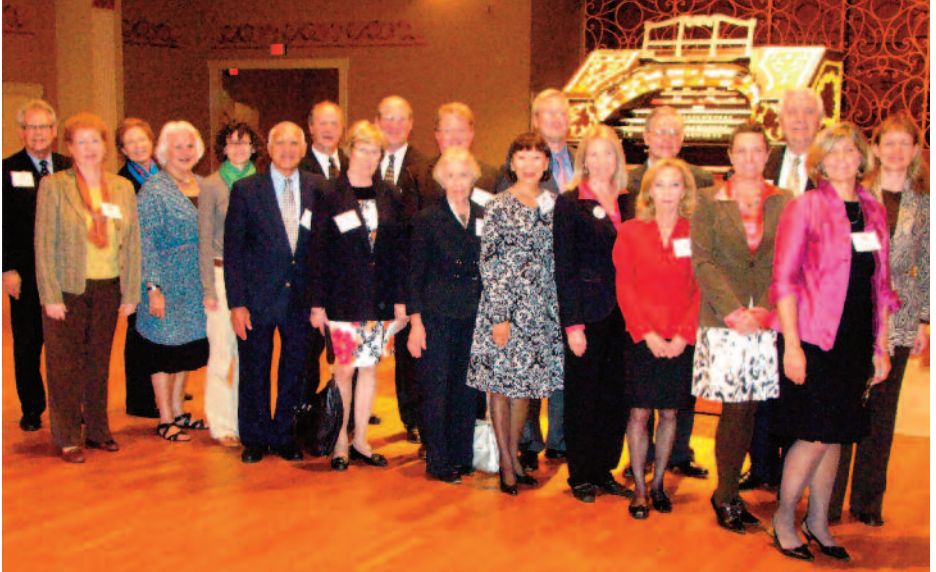
SPMH Board Directors and Liaisons with the Mighty Wurlitzer