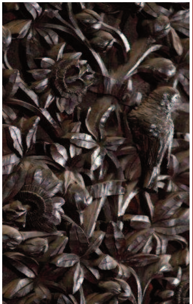
Detail of The Passion Flower