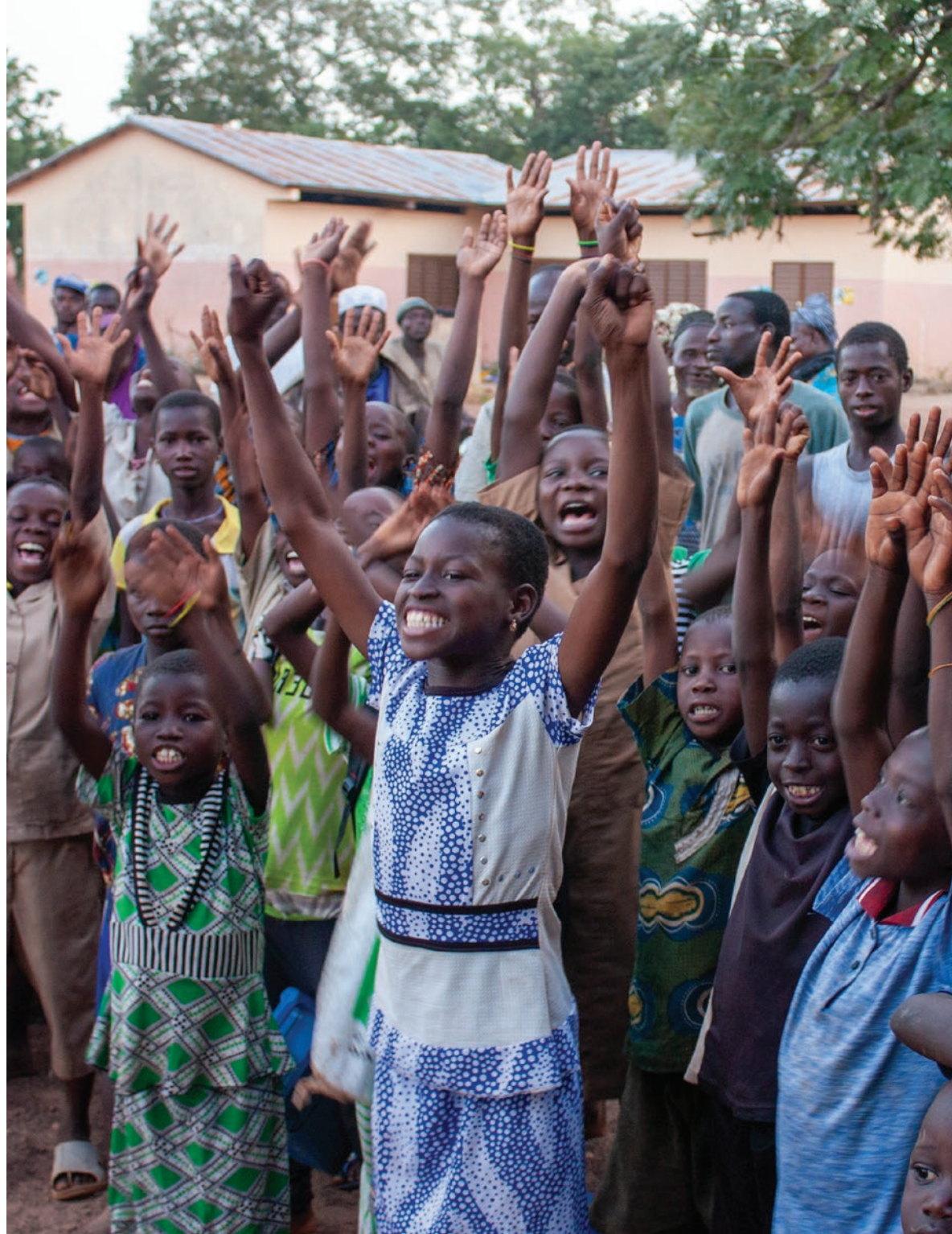
Children during a campaign event in Northern Benin