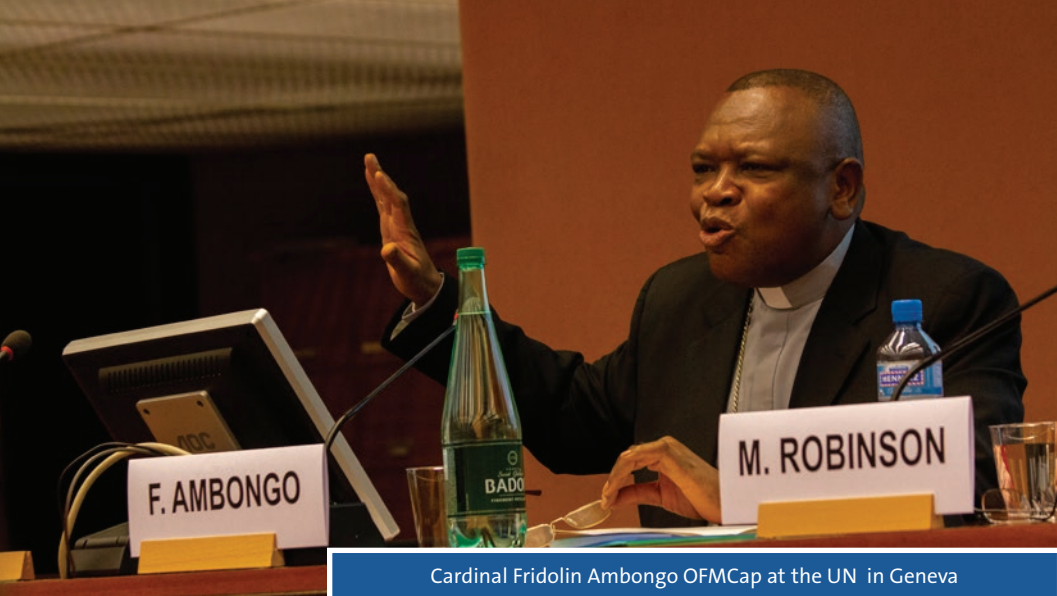
Cardinal Fridolin Ambongo OFM Cap at the UN in Geneva