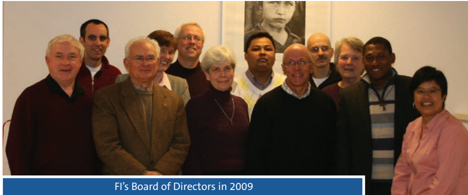
FI's Board of Directors in 2009