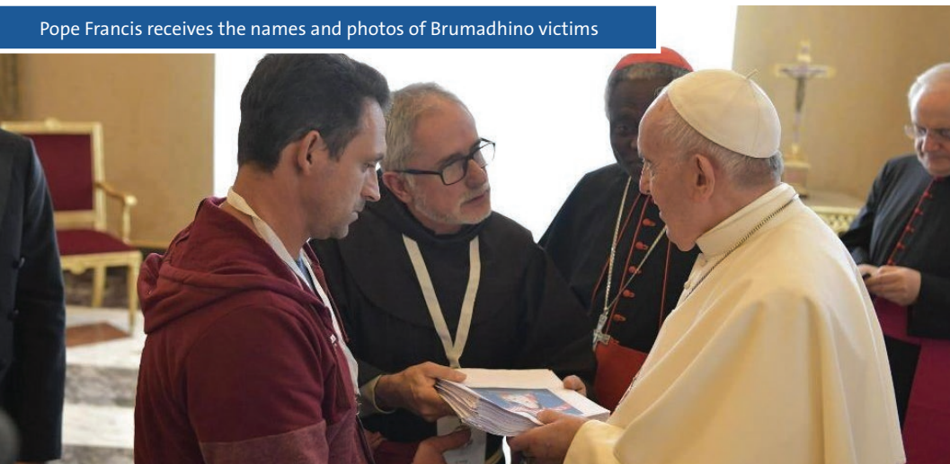
Pope Francis receives the names and photos of Brumadhino victims