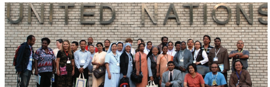
Franciscans after a meeting with the UN in Bangkok

After an intensive consultative process, the CFF decides to restructure FI in order to bring greater transparency to its operations and to more efficiently address the needs of the Franciscan Family. The Bangkok office and various other regional groups are dissolved. FI assumes its role as the voice "at" the UN, working on behalf of, and together with Franciscans. In New York and Geneva, it provides specific technical expertise and supports any member of the Franciscan Family seeking to bring an issue to the UN's attention.