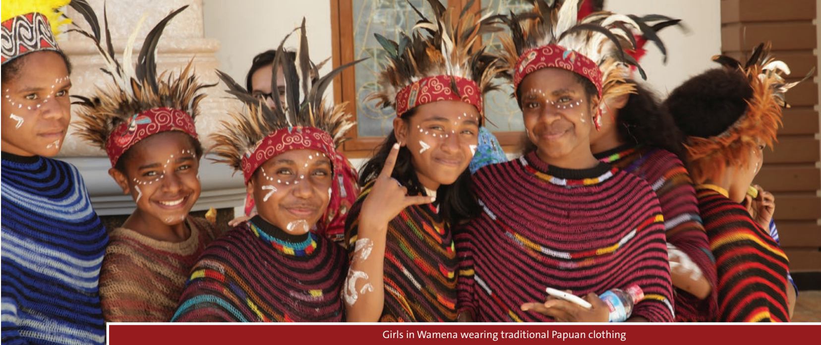
Girls in Wamena wearing traditional Papuan clothing

Just five minutes away from the convent where Yuliana works, in the harbor of Jayapura, large cargo ships pull in on a weekly basis, offloading people and supplies. According to the Indonesian authorities, these are used to further develop the island and improve quality of life. Many West-Papuans will claim these efforts are targeted at resource extraction, turning large parts of