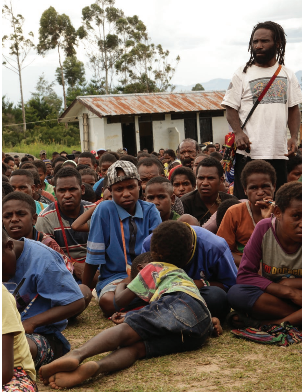
Internally displaced people fleeing violence in Nduga, West-Papua

Indonesia formally declared its independence in 1945. However, even after the United Nations formally recognized this four years later, the territories that are now Papua and West-Papua remained under Dutch control. It was not until 1962 that the UN brokered an agreement that would give the Papuans the right to determine their own fate – become independent or join Indonesia. Seven years later, 1,026 representatives unanimously chose the latter.