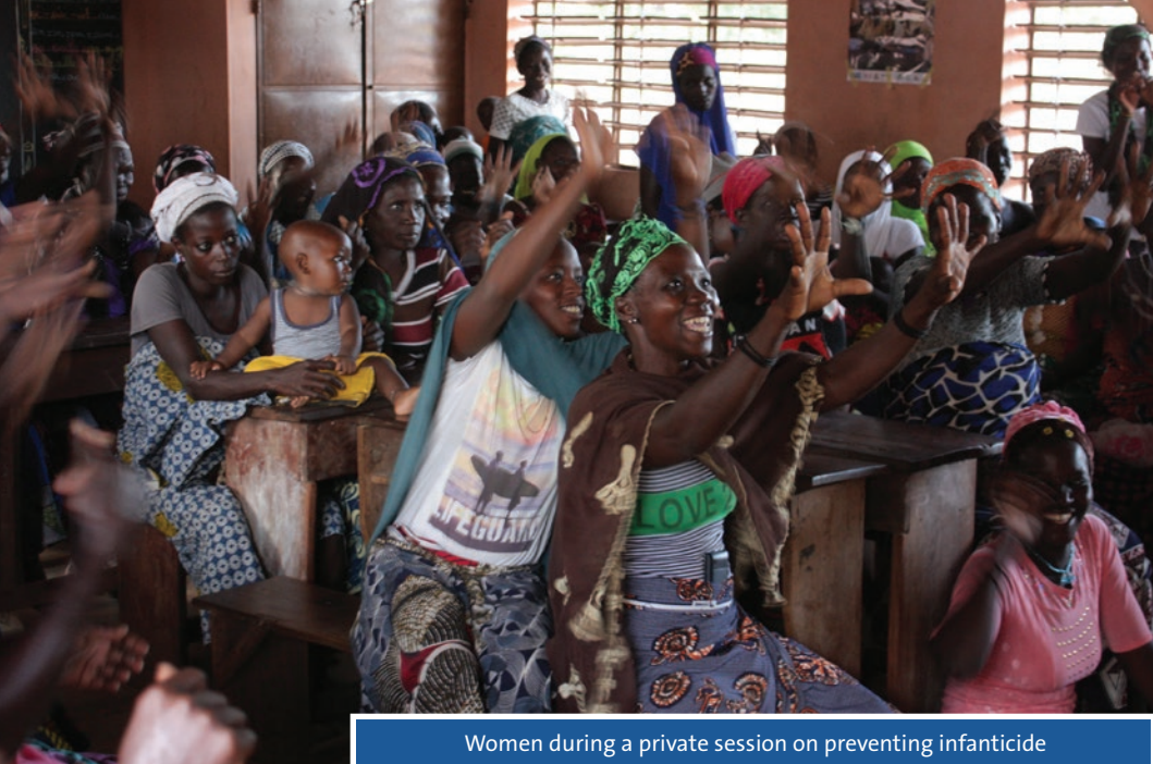
Women during a private session on preventing infanticide

recently bought a large piece of land in the north and they are currently raising funds to build a home, school, and church there to shelter abandoned children accused of witchcraft.