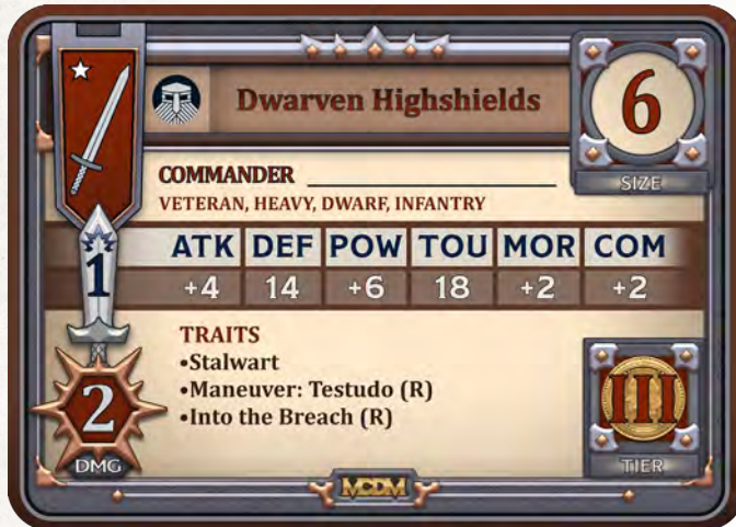
Dwarven Highshields unit card

If our minotaur heavy infantry are Tier III, we need to find another Tier III infantry unit to use as a template. In Kingdoms & Warfare , dwarves have the best infantry units, so let's see if they have any good Tier III infantry units.