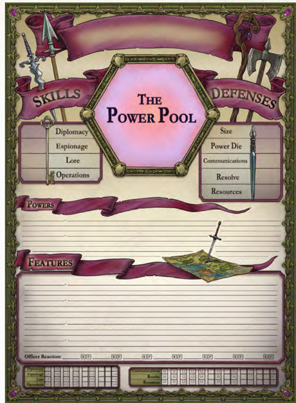
Color party sheet