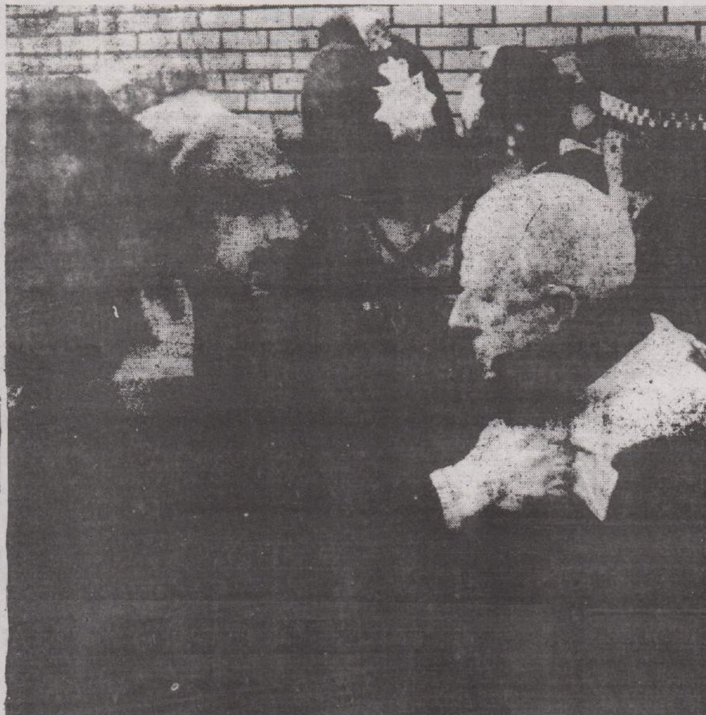
FACE TO FACE: A miner grabs hold of Coal Board chairman Ian MacGregor's coat.