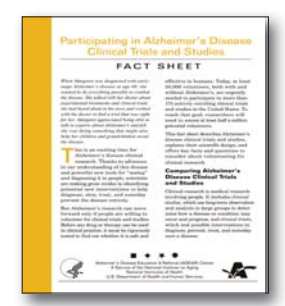
Participating in Alzheimer's Disease Clinical Trials and Studies Fact Sheet