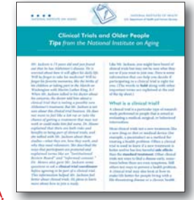
Clinical Trials and Older People TipSheet