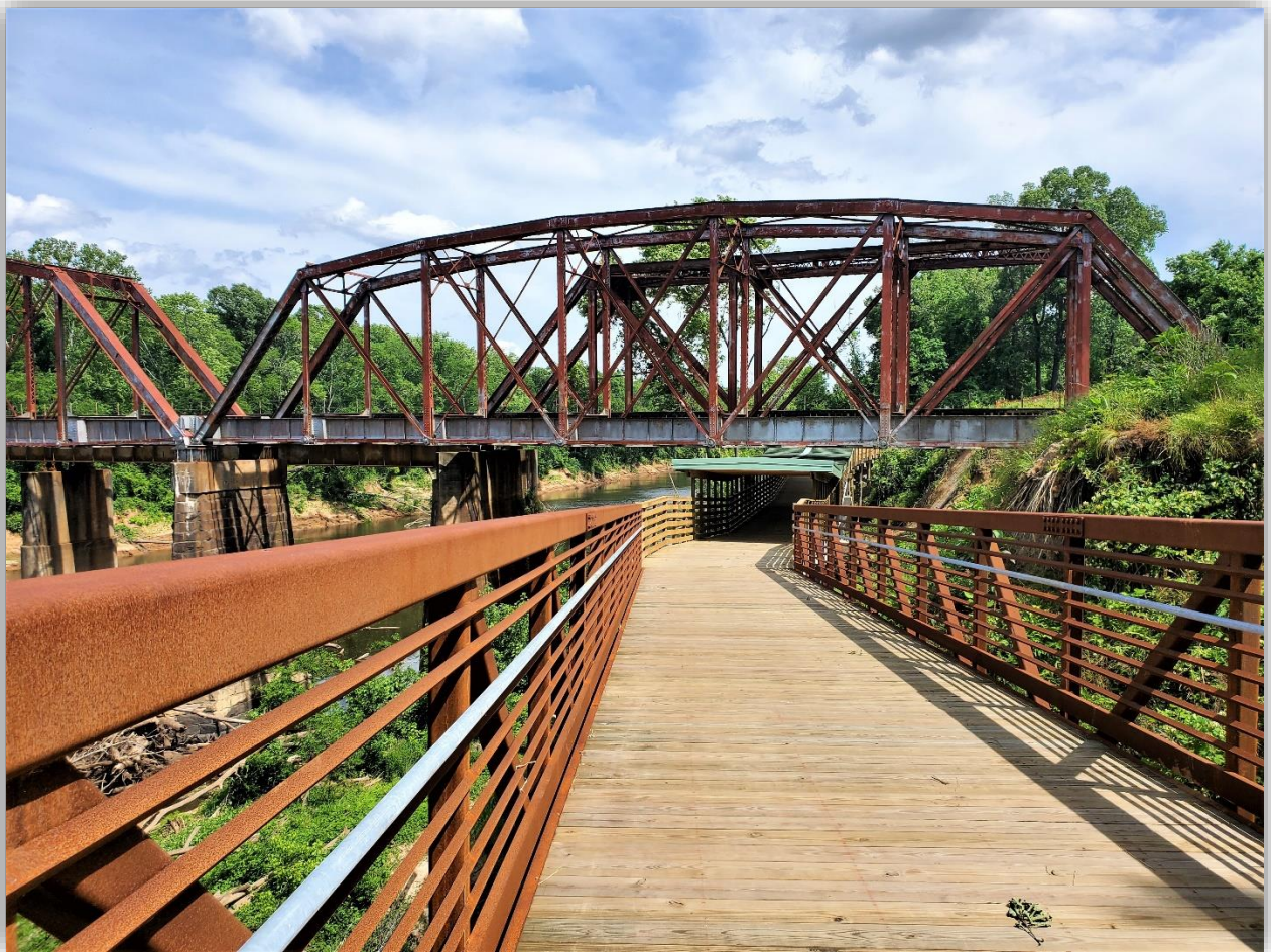
Cape Fear River Trail