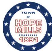
Town of Hope Mills