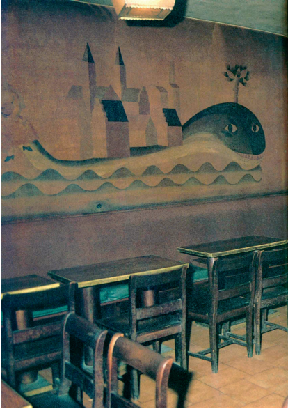
Coffee shop named "Happy Whale"

Madrid in the Coffee shop named "Happy Whale".