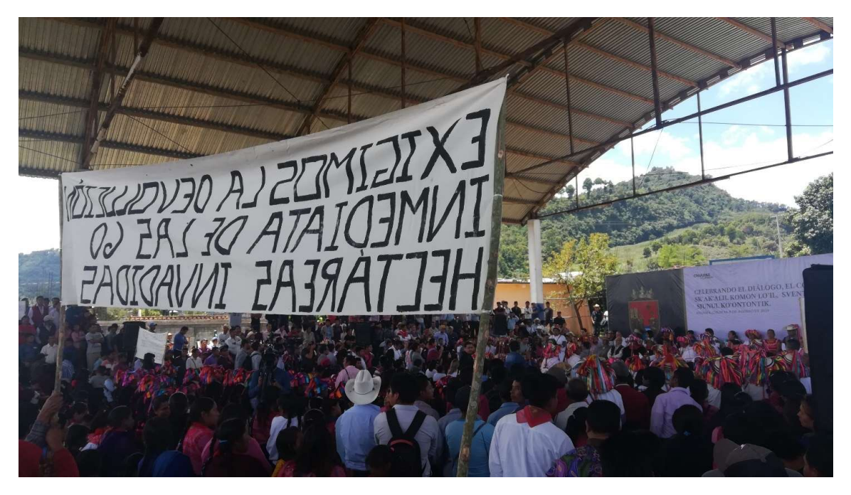
Fig. 3.6. The 2019 Aldama International Indigenous day event.

Apart from the fiasco of that event, it was sad and very interesting to witness how state rituals and rhetoric have changed very little since the middle twentieth century. The explicit folklorization of my friends was combined with a completely empty discourse about justice that has been promised since the peak days of the Partido Revolucionario Institucional (PRI). In that period, the relationship between the federal state and indigenous communities was created through networks of patronage authorities aligned with electoral processes. These were generally very far away from the real needs of the populations they represented. Despite their marginalization during this event, my friends have used many different means of activism to preserve their language and culture, and to demand the changes needed to make conditions more equal to the rest of non-indigenous Mexicans. It was a shame that the authorities missed the opportunity to hear their demands.