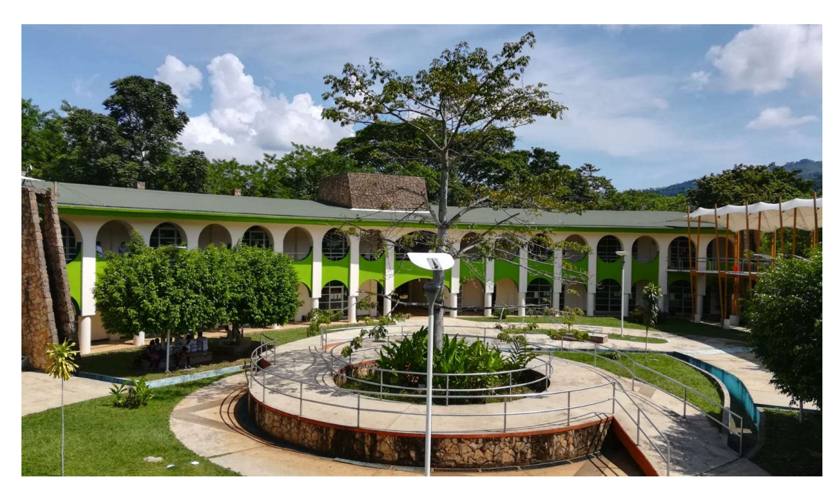
Fig. 3.5. The UIET campus in Oxolotán

In January 2019, I was invited to give a one-day seminar for the professors about mayanist archaeology and the history of the Maya peoples. I found a group of faculty members and administrators eager to get involved with the making of narratives about the ancient Maya and the histories they belong to. Since then, I have recognized the intercultural universities (including the Chiapas one in San Cristobal de las Casas, which unfortunately I have not been able to visit) as a very fertile ground for consulting about ethical and methodological aspects of archaeology with respect to indigenous rights. All the professors had anecdotes, tales, and beliefs associated with archaeological sites and materials. They had questions about the ways the ancient Maya practiced their foodways, medicine, and social hierarchies, as well as questions about archaeological methods and the uses we have for archaeological materials. Even among them, I saw a few surprised by the recognition of their language in hieroglyphic inscriptions, but most of them knew about the relation of Classic inscriptions and the Cholan languages.