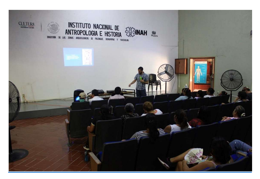
Fig. 3.8. The workshop at the Museum in June 2023, taken from its Facebook page. 17

The group, with a majority of women, were all familiar with what archaeological fieldwork entails. They have friends and family members who have participated in excavations, and they have seen the process themselves. A general perception of archaeologists among the audience was that of opacity, about how they are kept from what happens after the fieldwork. We simply don't share with the public the results of the many specific investigations done through site surveys, excavations, and materials analysis.