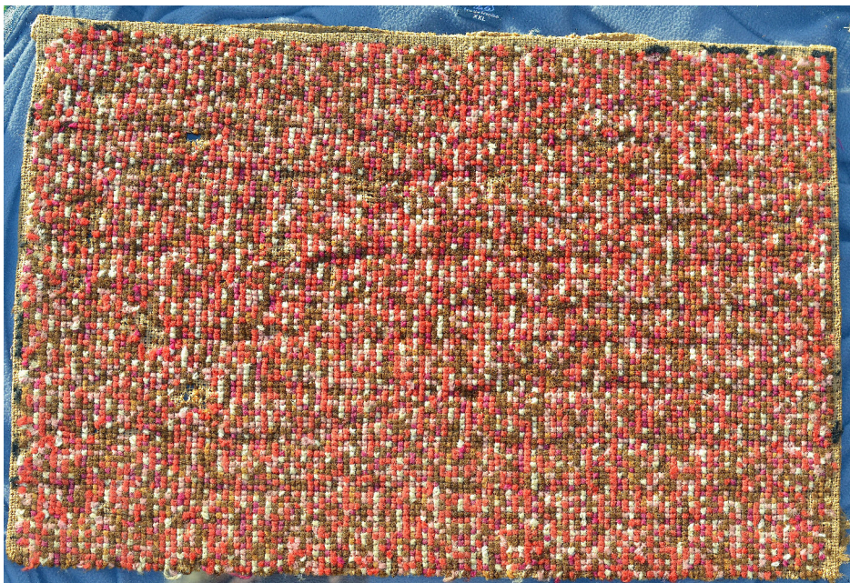
Figure 1: The carpet.

testimony of its type concerning this historic period.