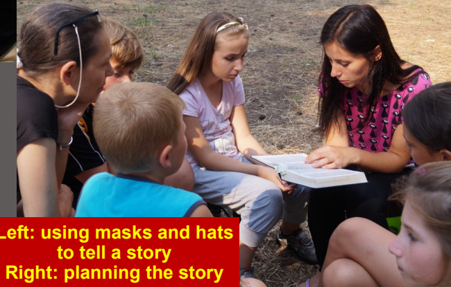
Left: using masks and hats to tell a story Right: planning the story