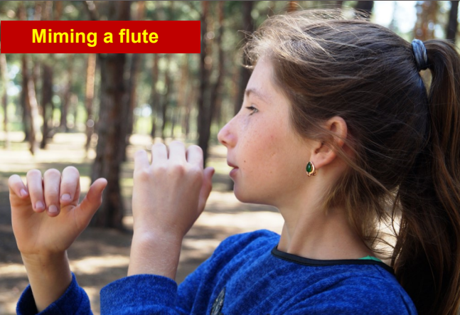
Miming a flute