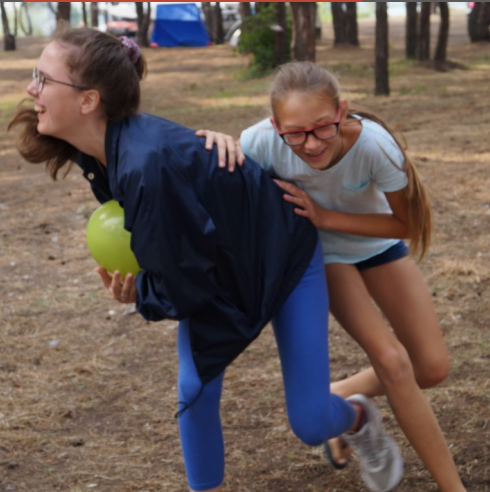
One of our many drama games—using balloons

We did a similar workshop with SMILE at their camp in 2013. Some of the participants of that camp acted as youth leaders and helpers this year in these camps working along side us, making a great team! The key concepts that we continually emphasized were: energy, concentration, imagination, and heavenly inspiration!