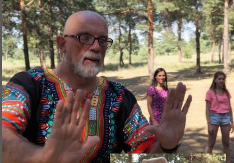
Above & Below: Learning the 8 basic efforts Right: using flashcards to reinforce ideas.