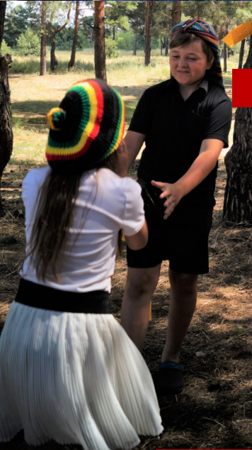
The story of the Prodigal Son