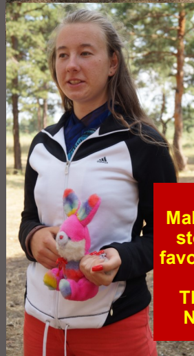
Left: Making original stories using favourite objects Right: The Camel's Nose story.