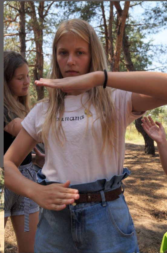
Right: being a robot or staccato while learning fluid movements from a neutral position.