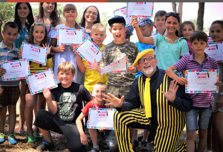
On the last day of the camp with our enthusiastic performers.