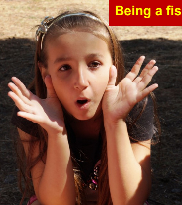
Being a fish