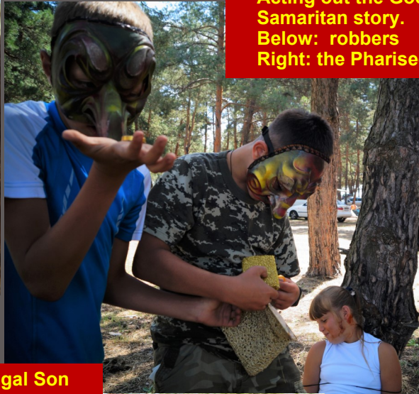
Acting out the Good Samaritan story. Below: robbers Right: the Pharisee