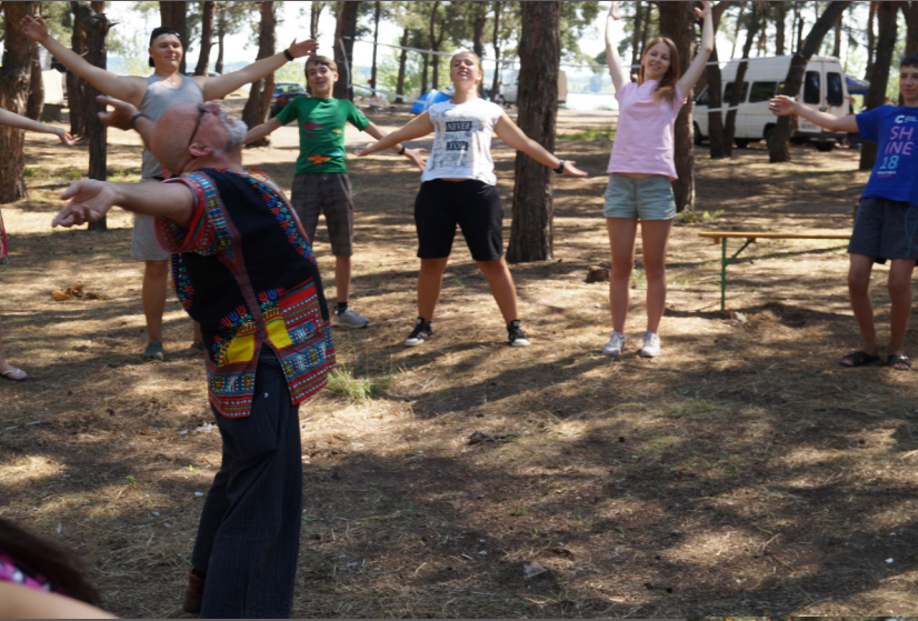
Left: Warm up exercises: contraction and expansion being a balloon that inflates and deflates.