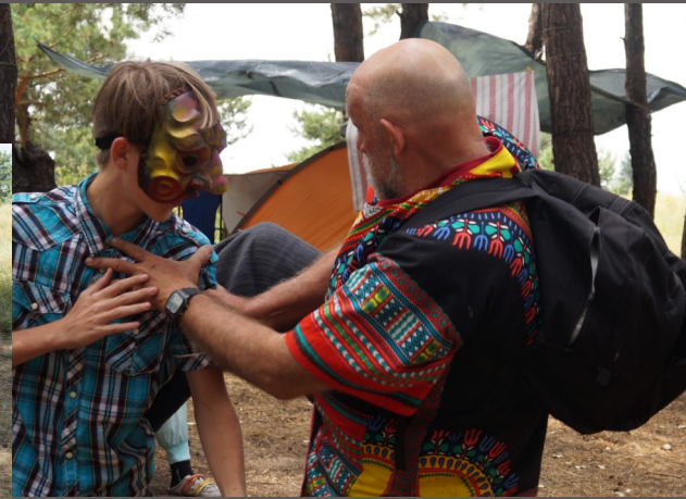
Far left: the Widow's Mite story. Center: the story of salvation Above: Oh, the Places You'll Go! story