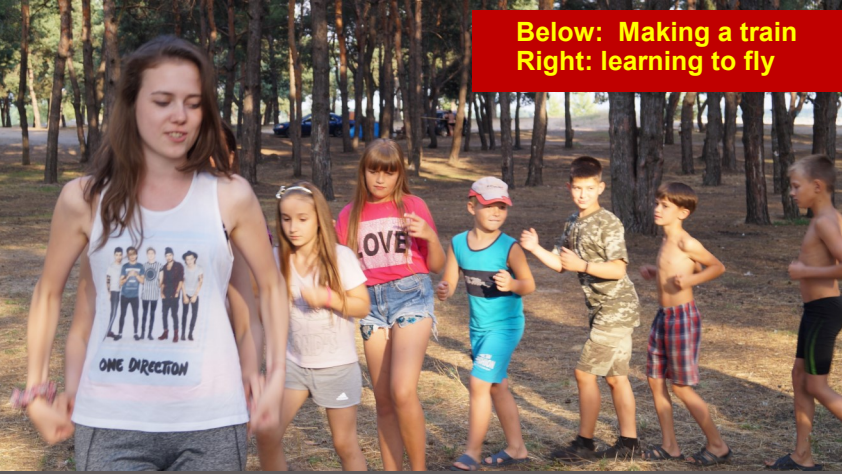
Below: Making a train Right: learning to fly