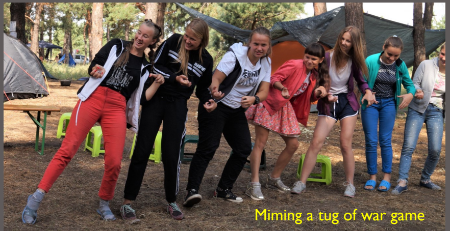
Miming a tug of war game