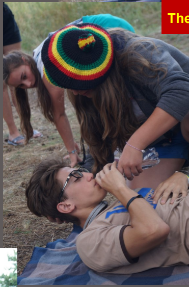
First two rows: The Good Samaritan Story