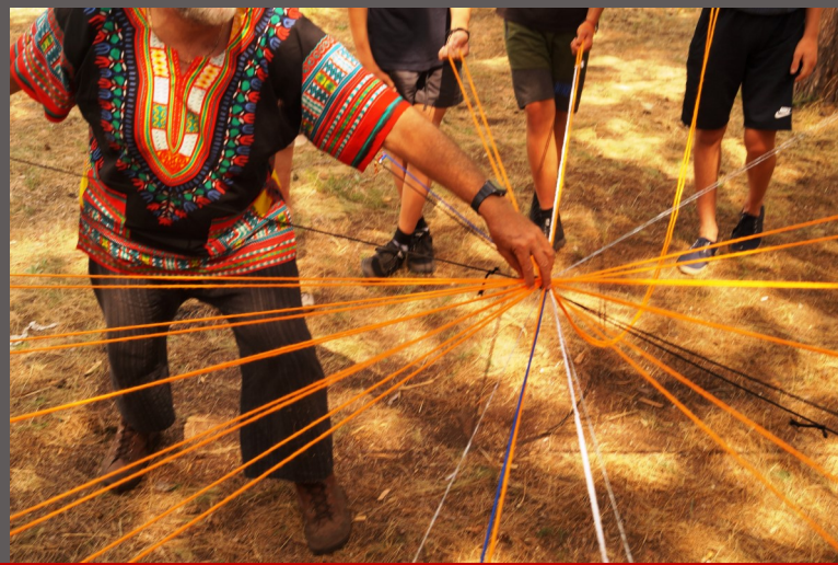
Above right: yarn game to review lessons and central theme.

“I liked the activities during the mime classes, especially the last game of trust. I liked working with and making masks and the exercises where we learned different emotions.”