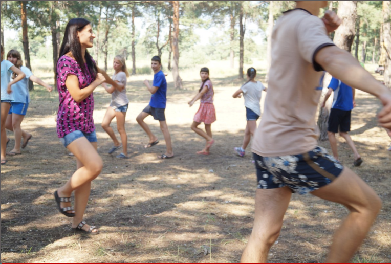
Above left: finding new ways of walking