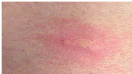
Distinct skin reddening directly after the injection.

A mild local inflammation may develop around the injection site. This appears as distinct reddening of the skin with blurred edges. Itching may develop at the same time.