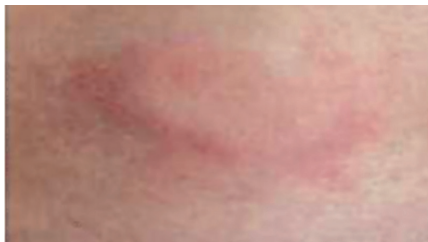
Typical picture of a local reaction 4 hours after injection.

A mild local inflammation may develop around the injection site. This appears as distinct reddening of the skin with blurred edges. Itching may develop at the same time.