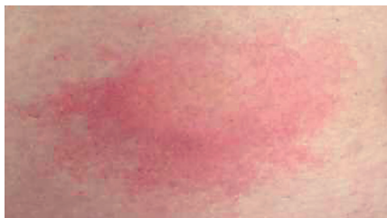
Typical picture of a local reaction 10 hours after injection

The edge of the local reaction becomes smoother after approx. 4 hours. It may itch again.