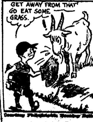
GET AWAY FROM THAT! GO EAT SOME GRASS.