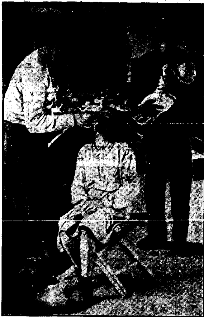
IN A VILLAGE SCHOOLROOM near Cass, in Normandy, a British doctor from a nearby R.A.F. airfield— from which fighters planes continually go out to strike at the enemy—gives his spare time to caring for the local French people, who are short of doctors. In this picture he is attending to a mother while an airman holds her baby. Note the sympathetic pup in the left corner.

respective homes it was the universal opinion that another successful party could be credited to the Grosse Pointe Post No. 303.