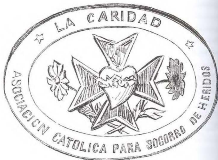
Figure 2. Emblem of «La Caridad».

by means of ambulance services, provision of blood and specialised war hospitals. La Caridad's members wore a very similar uniform to that of the Red Cross, although their emblem was a red Maltese cross on a white background and with the Sacred Heart in the middle 15 .