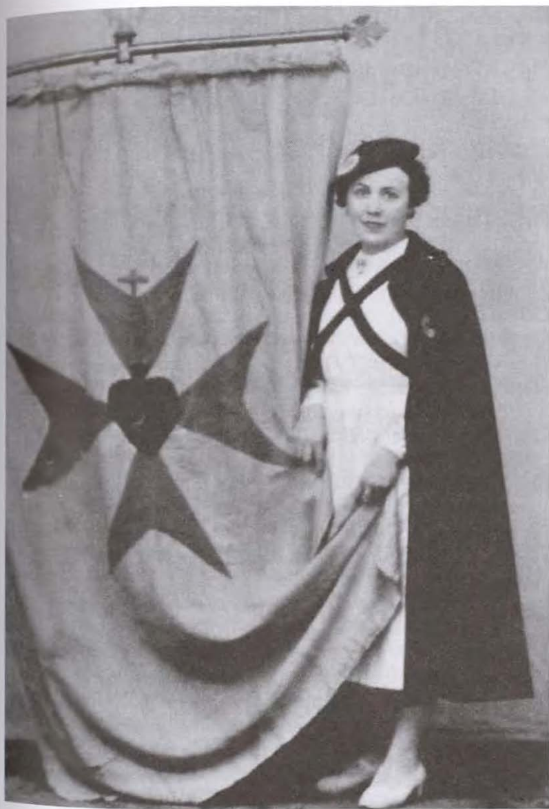
Figure 4. «Margarita» with La Caridad's flag. The picture was taken in 1938, but the flag was the one flying during the Second Carlist War in La Caridad's hospital at Lesaca.