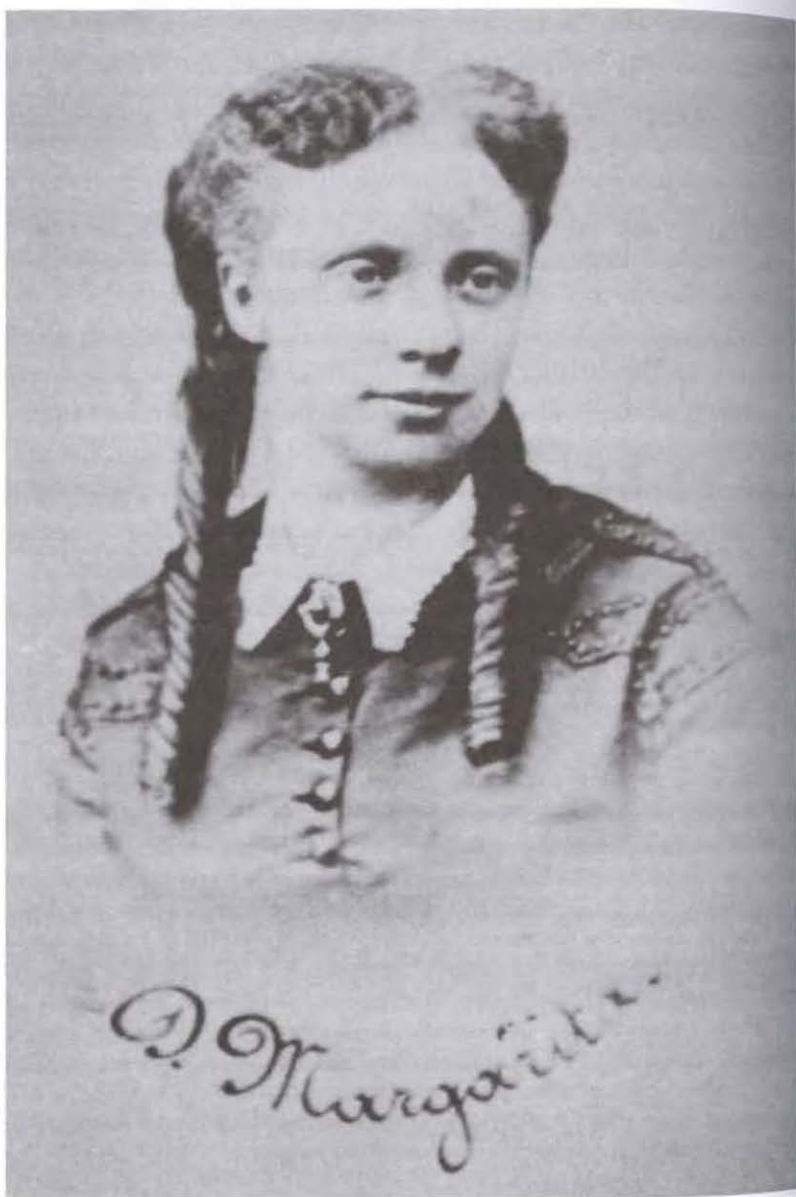
Figure 1. Margarita de Borbón Parma, the founder of «La Caridad».