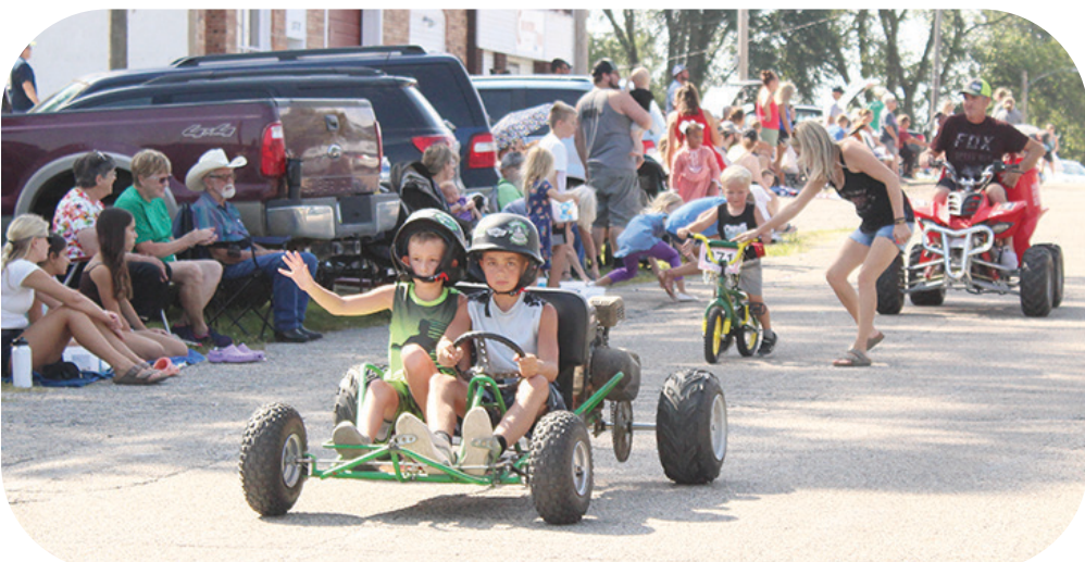
Young motorists had a chance to ride in the parade occasionally stopping to grab a piece of candy for themselves.