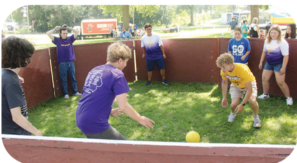
Fun was had by all ages at this year's Old Settlers event held in Magnolia. Here you can see members of the LOMA Marching Band playing GAGA Ball, a game similar to dodge ball.