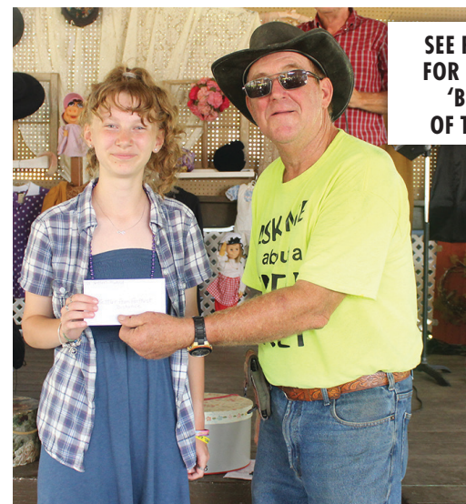
SEE PAGES 6-7 FOR MORE ON 'BEST DAY OF THE YEAR'