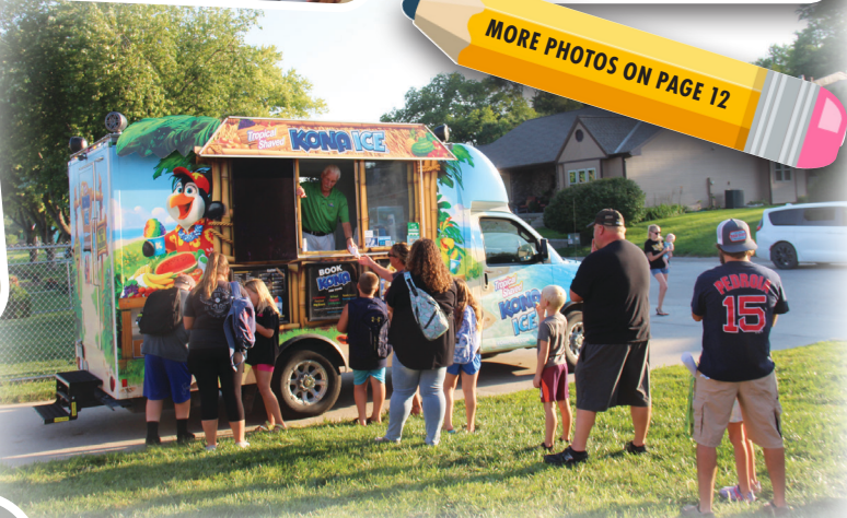
Kona Ice was in the house, offering sno-cones on a warm day.