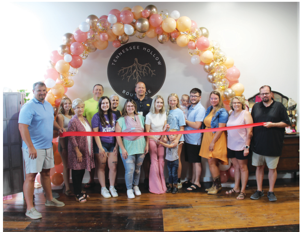
Tennessee Hollow Boutique, located at 403 E Erie St., held a ribbon cutting this past Saturday.