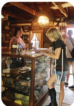
Magnolia's historical cabin was open for the public to view in addition to a number of vintage items.