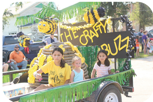
The Crafty Buzz of Missouri Valley had a float in the Old Settlers parade that was a crowd favorite.