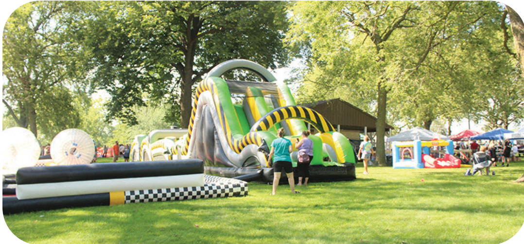
This year's annual Old Settlers celebration was held in Magnolia over the weekend. The celebration was full of community fun and activities including a parade, live entertainment, vendors, games, inflatables and much more.