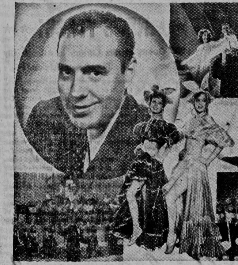
Put together more than a dozen of radio's brightest stars—add a liberal helping of top movie favorites—season with Benny Goodman's Orchestra and Leopold Stokowski and his Symphony Orchestra—