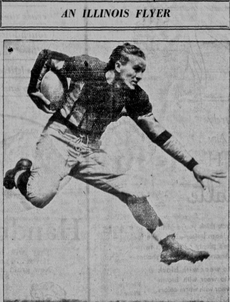
AN ILLINOIS FLYER

With all hands on deck and in fine shape for battle, City high will journey to Cedar Rapids tonight to take on the Franklin high school outfit on Hill park field. This will be the second game for the Hawklets this week, as Clinton was tied 0 to 0 here last Monday night.