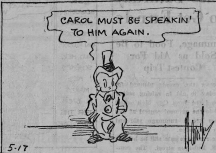
Percy L. Crosby, Great Britain rights reserved. © 1934, King Features Syndicate, Inc.