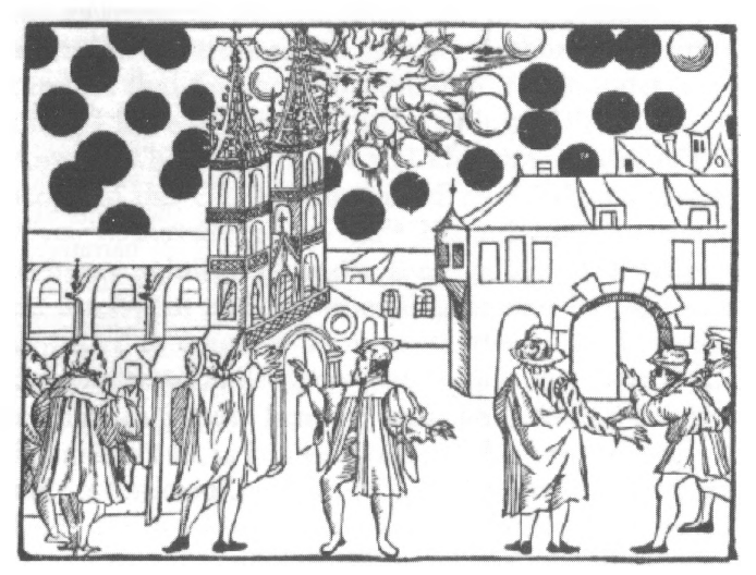
Figure 1: Objects allegedly observed over Basel, Switzerland, on August 7, 1566.