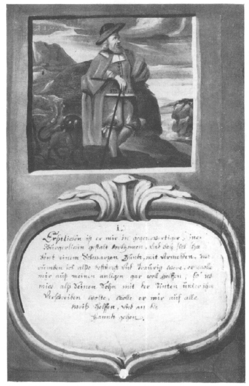
Figure 3: First appearance of the Devil to Christoph Haizmann.