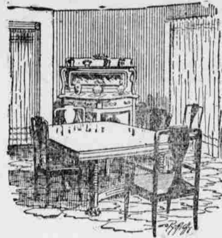
5 foot Oak Extension Table, $6 75 3 " " " " 8 50 3 " " " " 5 in. leg, 16 00