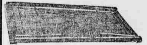
Woven Wire Cots, 3 foot, braced like cut $3 25 Same, 2 foot 6 inch 2 75 Woven Wire Cot, not braced, 2 ft 6 in, 2 25

We are headquarters for everything in the Furniture, Carpet, Stove, Hardware and Tinware line. We wish you one and all a happy New Year and solicit a portion of your business and GUARANTEE SATISFACTION on every article.