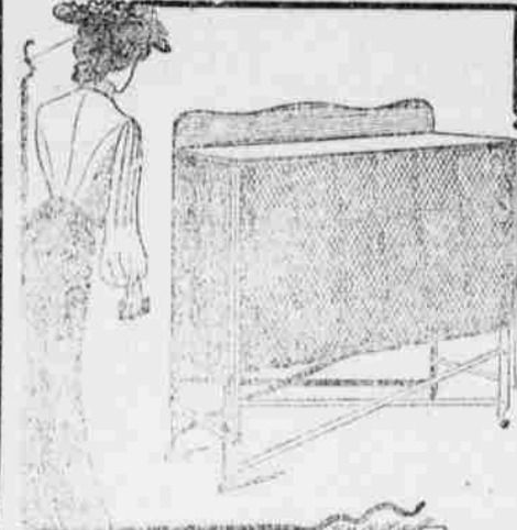
Steel Mantle Folding Bed, $11 00 Sanitary Steel Folding Couches and Davenport, with mattresses, 10 50