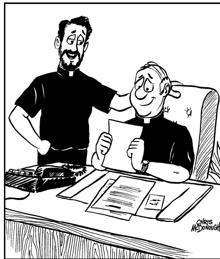
"Don't worry about them hearing a homily from last year again. We're lucky if they heard it the first time."