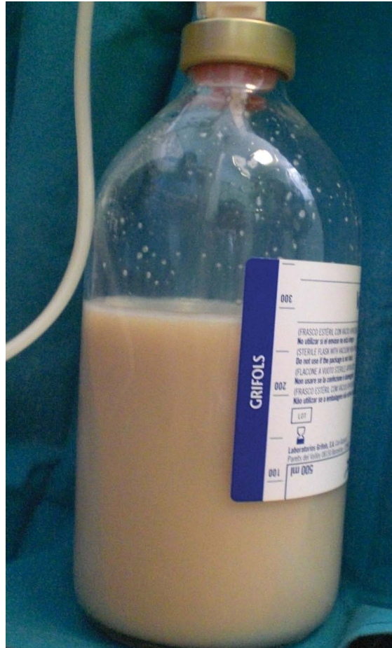
Figure 4: Enteral nutrition obtained after thoracentesis.