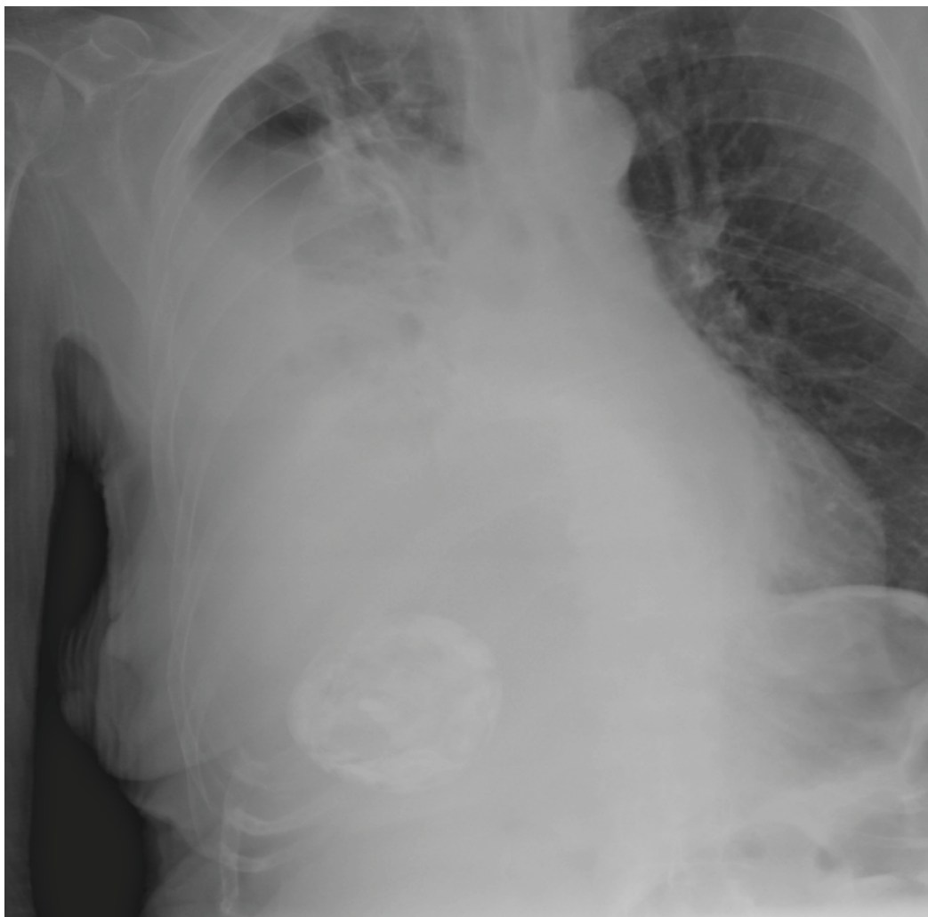
Figure 2: Hydro-pneumothorax clearly seen after removal of the nasogastric tube.

A 75-year-old female patient with past medical history of severe Alzheimer's disease, totally dependent with nasogastric tube feeding (NGT) presented to the emergency department with worsening dyspnea in the past 48 hours. Physical examination revealed on auscultation decreased air entry over the right lung and dullness to percussion. Two days before admission the patient had the NGT changed and a chest X-ray to corroborate position that was checked by one of the junior doctors and discharged to the nursing home. A thoracic bedside ultrasound demonstrated right pleural effusion. A chest radiograph revealed malposition of the NGT in the right pleural space and hydro-pneumothorax, the NGT was immediately removed without complications and thoracic drainage was inserted obtaining 1200 ml of enteral nutrition (Figure 1, Figure 2, Figure 3 and Figure 4). Her hospital course was satisfactory, and the patient was discharged 7 days later.