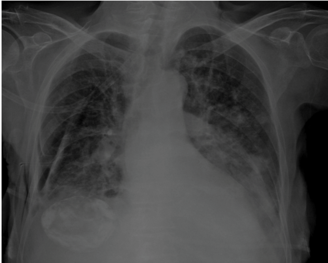
Figure 3: Resolution of hydropneumothorax after thoracentesis.